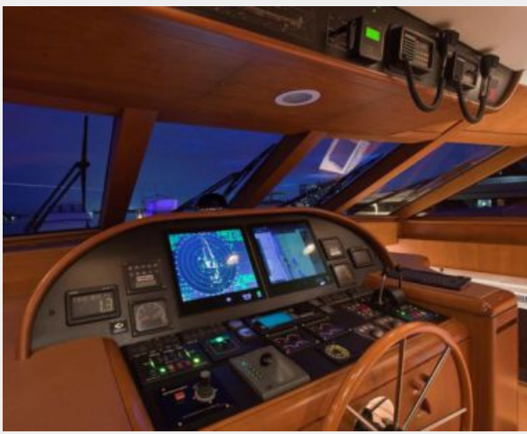
Pilothouse / Helm