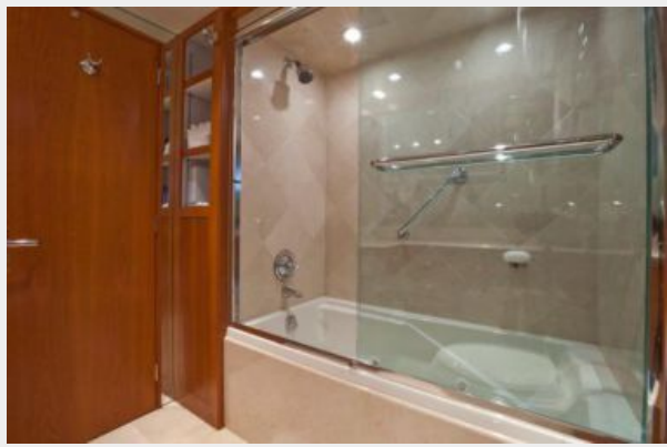
Master Bath / Hers