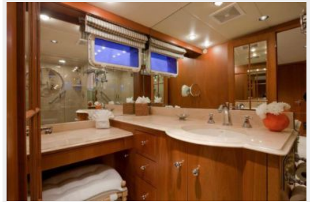
VIP Twin Stateroom / Head