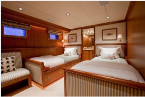
VIP Stateroom / Twin