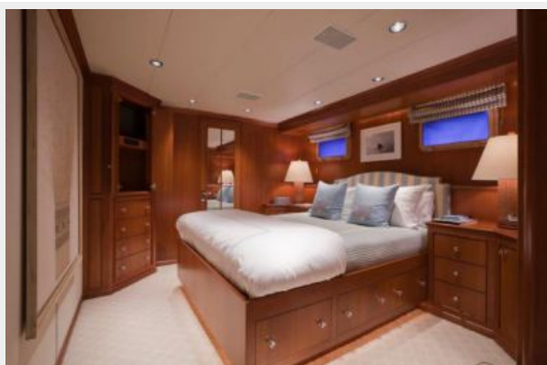
VIP Stateroom / Queen