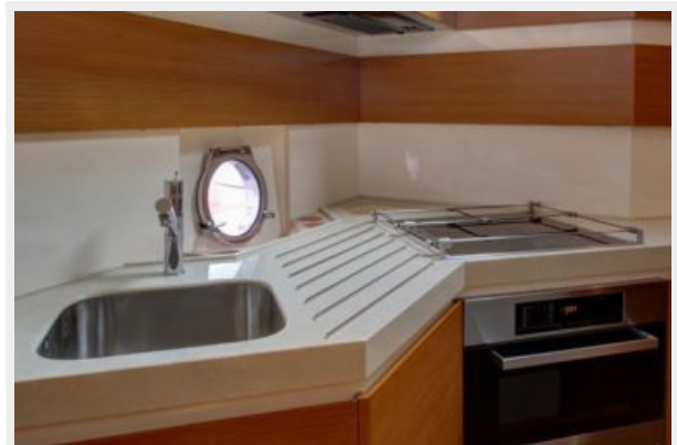
Galley Stainless Steel Sink