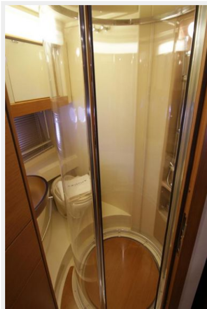
Bow Stateroom Shower