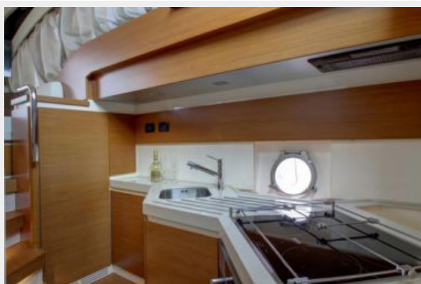
Galley (3) Burner Glass Ceramic Range