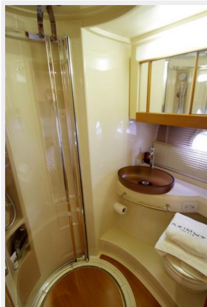
Guest Day Head (2)