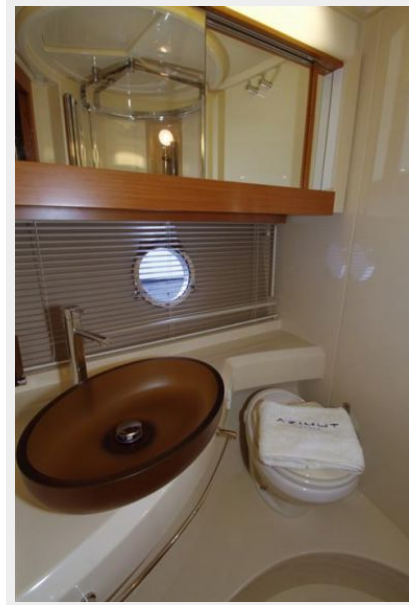
Bow Head (2)