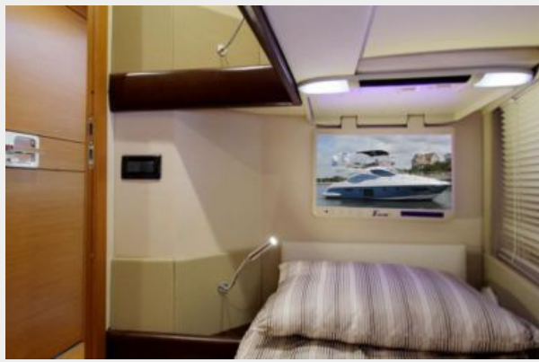
Guest Bunk Stateroom (2)