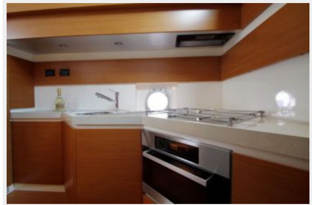
Galley to Port