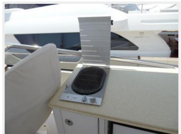
Fly Bridge - Grill