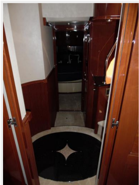
Lower Deck Landing