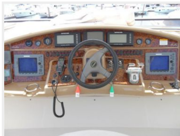
Fly Bridge Helm