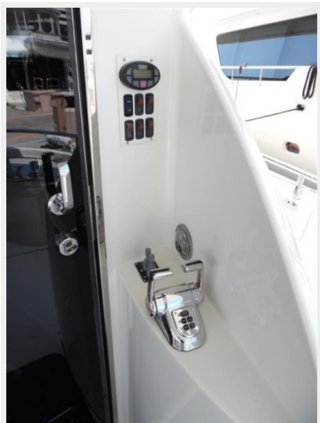
Aft Deck Steering