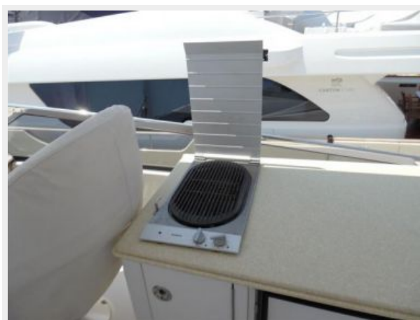
Fly Bridge - Grill