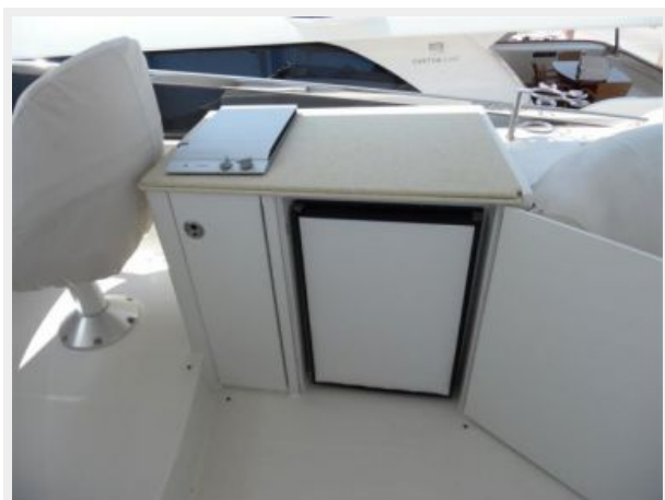
Fly Bridge - Refrigerator