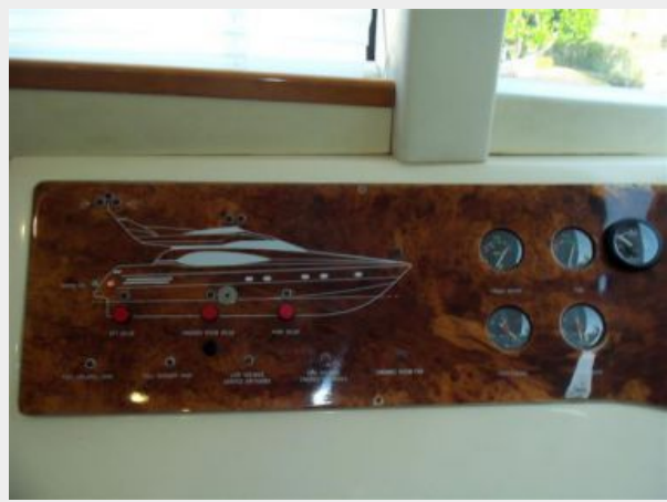
Portside of Helm