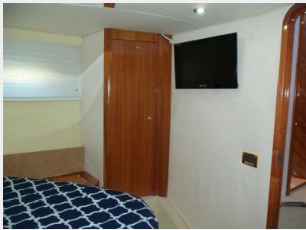
Master Looking Forward