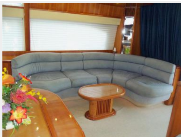
Salon Starboard Side Settee