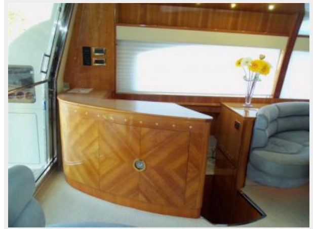
Salon Joinery Detail