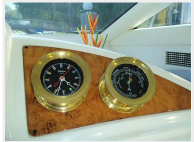
Starboard Side of Helm