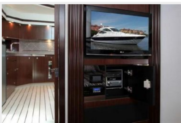
Master Stateroom Entertainment System