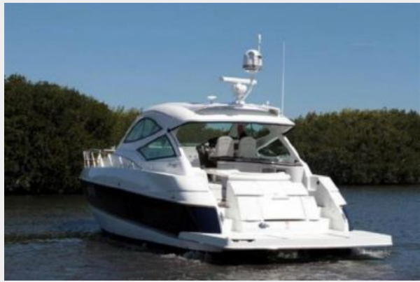
Port Quarter Profile