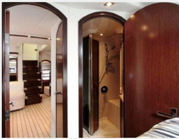
Forward Stateroom Entrance to Head