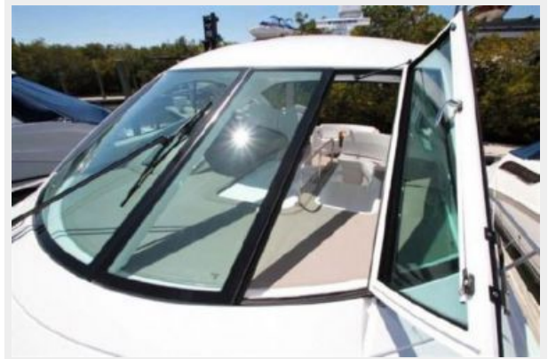
Walk Through Windshield