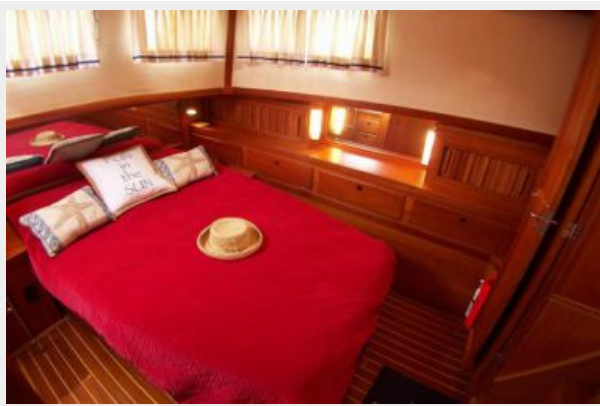
MSR to Port