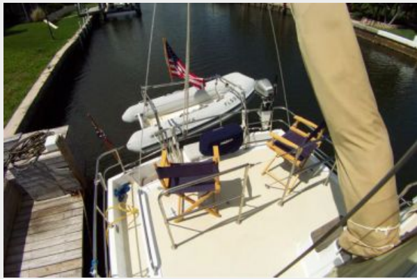
Aft Deck View from Flybridge