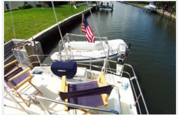
Aft Deck - Chairs not included