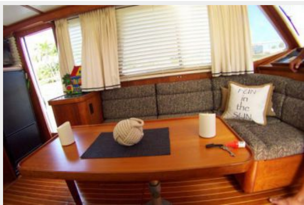
Dinette to Starboard