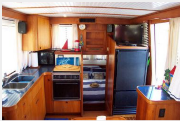
Galley Aft - Entrance to Master Stateroom