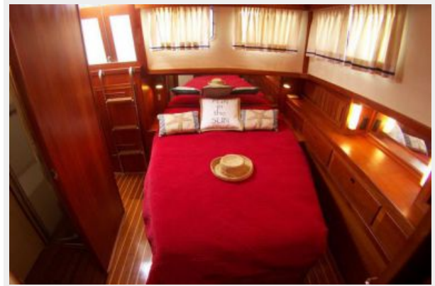
Comfortable Master Stateroom