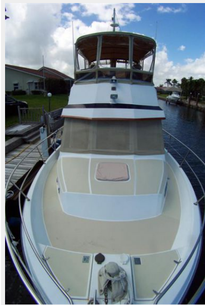
Flybridge View from Bow