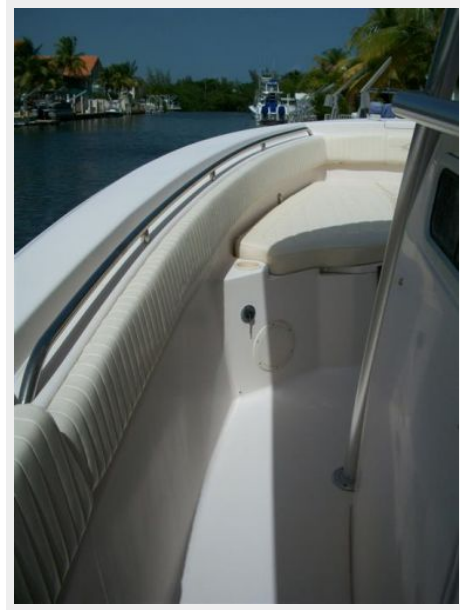
Wide Side Decks