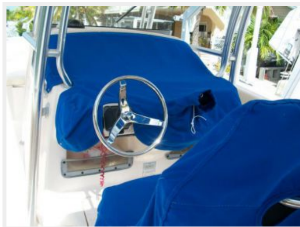
Console and Seat Covers