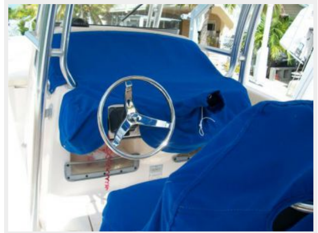
Console and Seat Covers