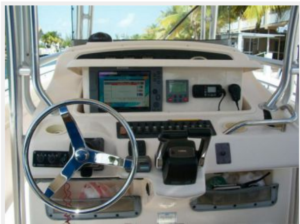
Helm - Nav Instruments