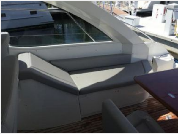
Starboard Chase Lounge