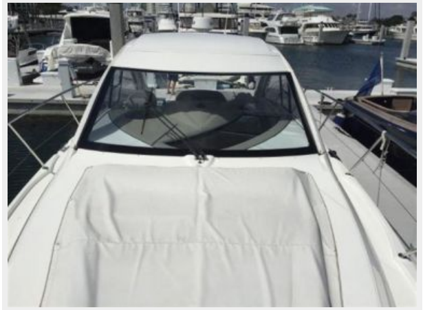
View from Bow - Covered Bow Cushions