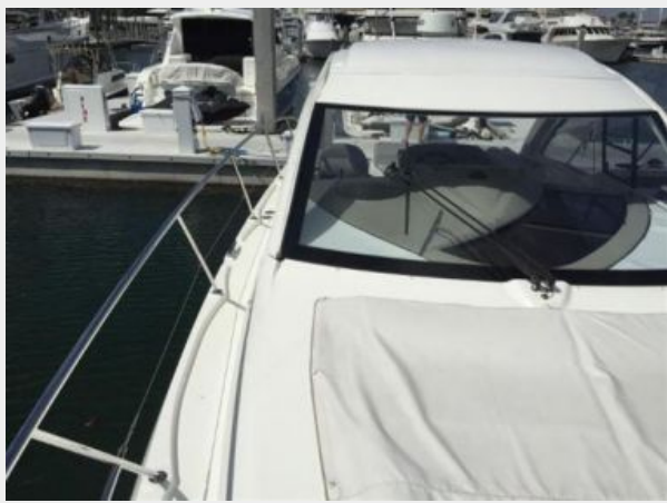
View from Starboard Bow