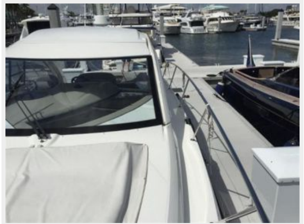
View from Port Bow