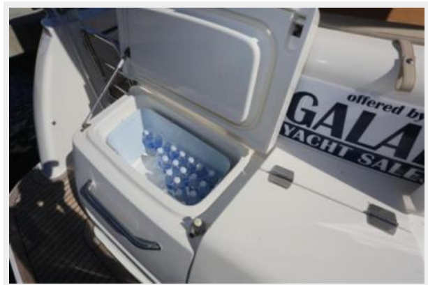
Entrance to Lazarette