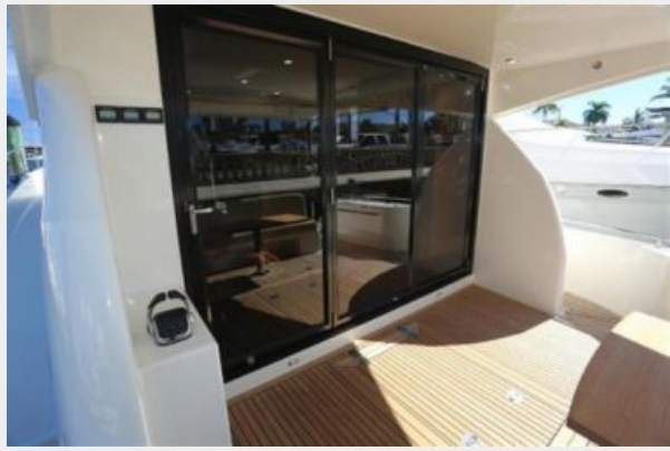
Cockpit Docking Station