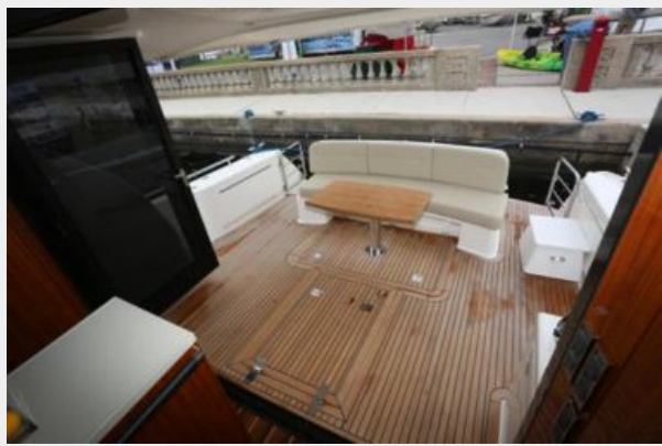
Open Aft Galley to Cockpit