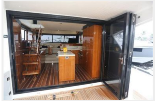
Cockpit Bi-Folding Doors