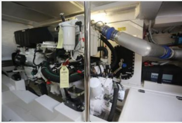
Starboard Volvo D11 670HP