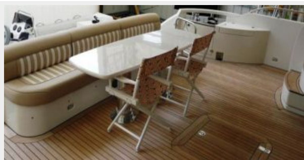
Aft Deck Lounge