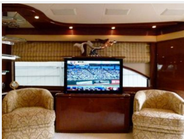
Salon Starboard Side 1