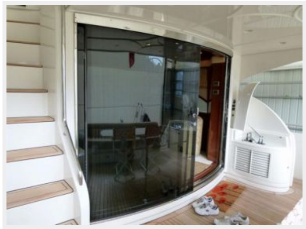
Aft Deck/Salon Entry