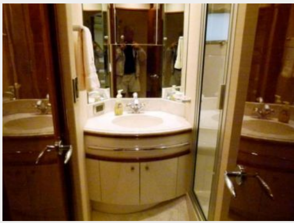
Guest Head 1