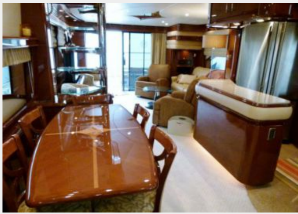
Dining Area 1