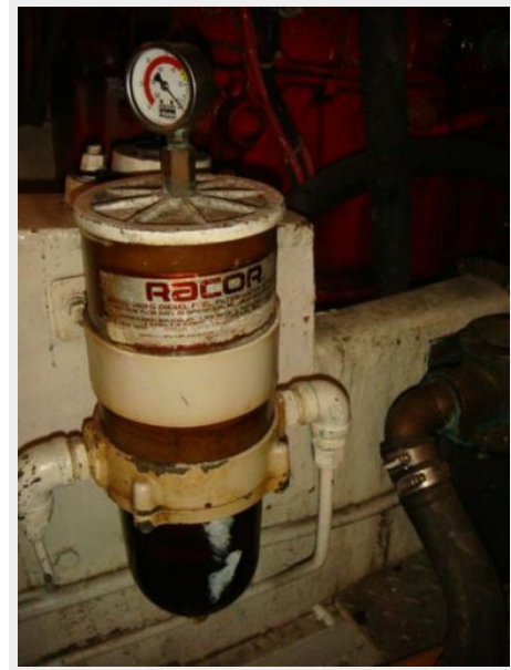
43' Tradewinds Starboard Racor Fuel Filter