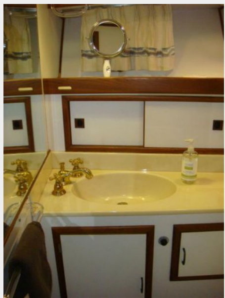
43' Tradewinds Guest Head