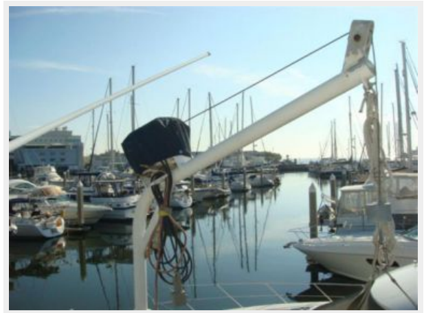
43' Tradewinds Tender Davit