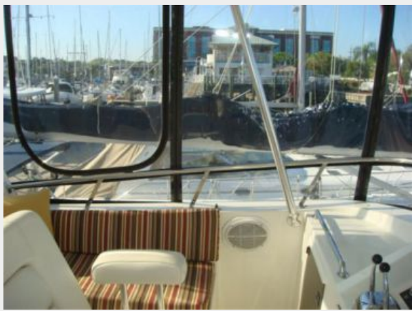
43' Tradewinds Flybridge Port