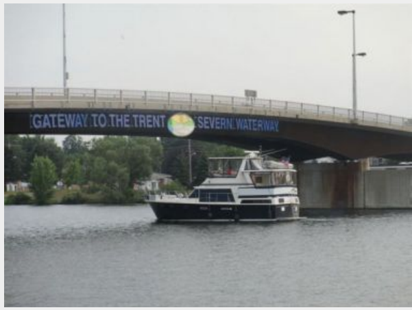
43' Tradewinds Port Aft Profile