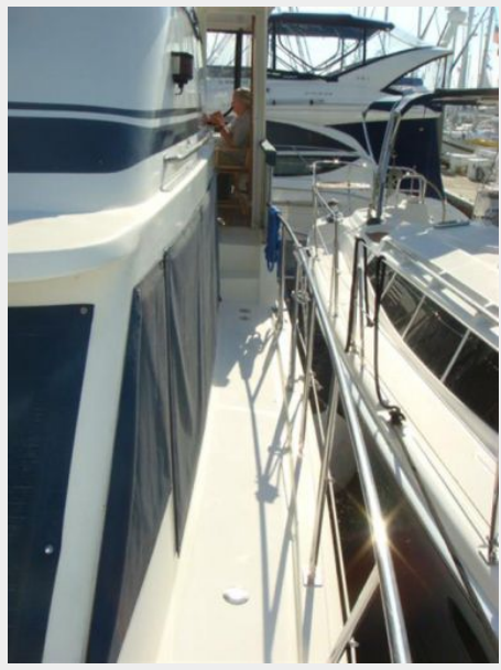
43' Tradewinds Port Side Deck Photo1