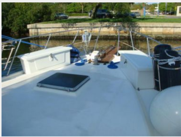
43' Tradewinds Foredeck