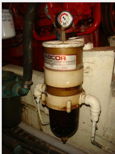
43' Tradewinds Port Racor Fuel Filter