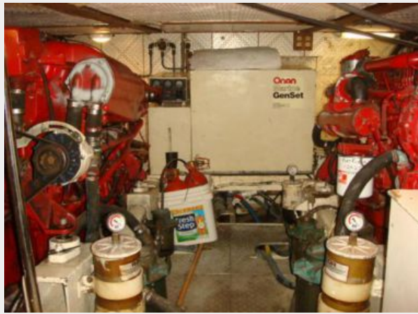
43' Tradewinds Engine Room Aft