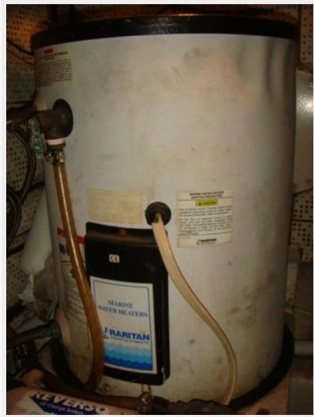
43' Tradewinds Water Heater