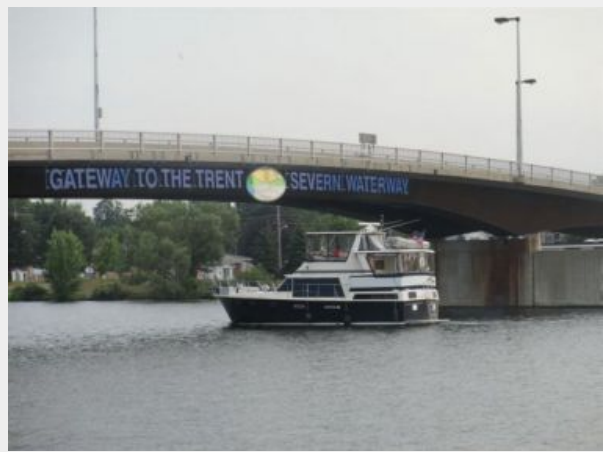
43' Tradewinds Port Aft Profile