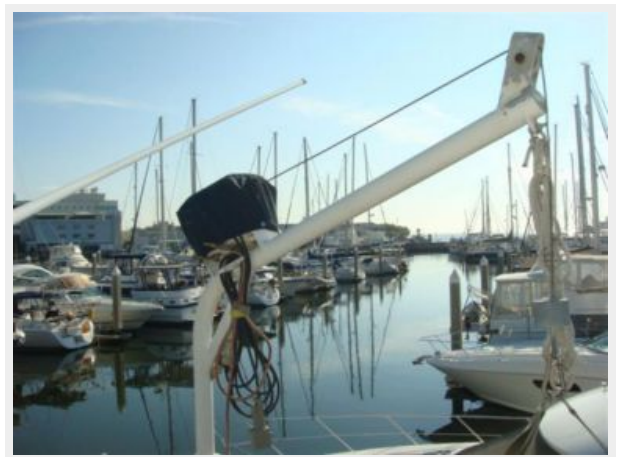
43' Tradewinds Tender Davit