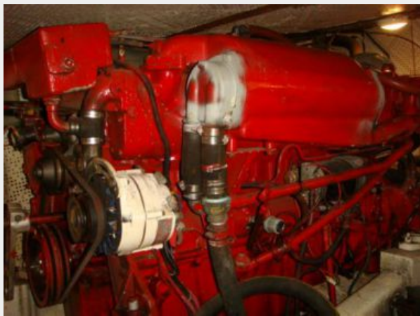
43' Tradewinds Starboard Main Engine