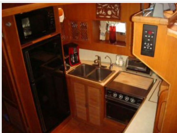
43' Tradewinds Galley Photo1