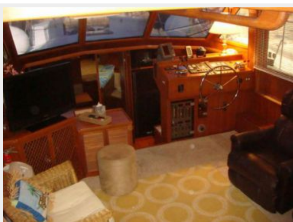
43' Tradewinds Salon Forward