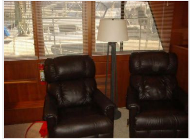
43' Tradewinds Salon Starboard