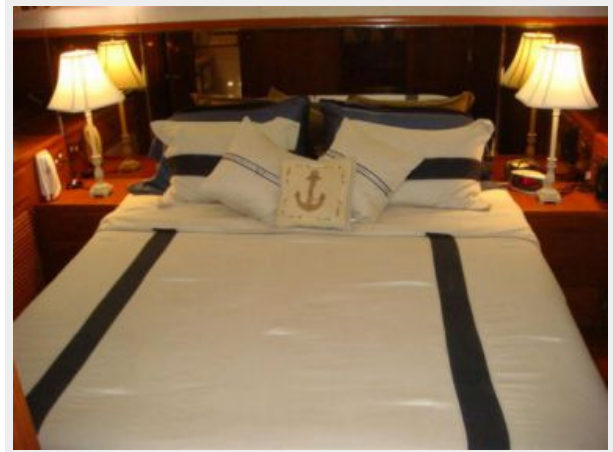
43' Tradewinds Master Stateroom