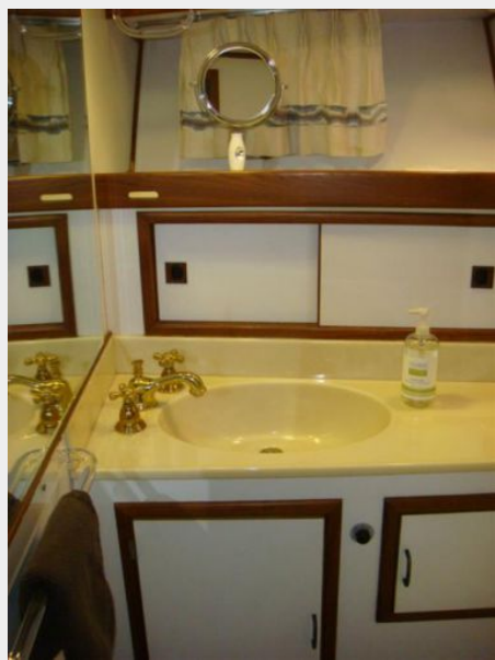
43' Tradewinds Guest Head