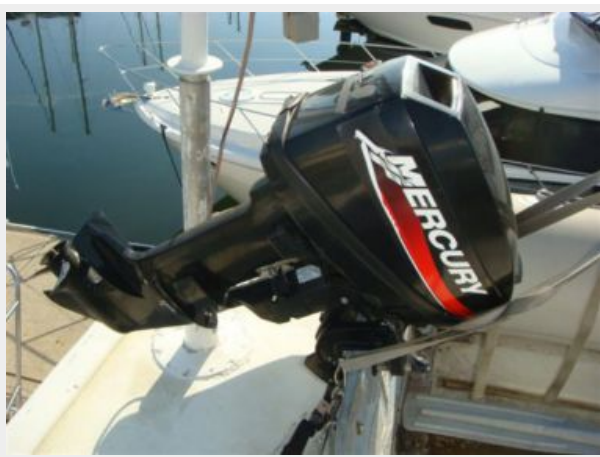
43' Tradewinds Tender Outboard