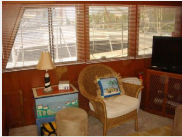
43' Tradewinds Salon Port