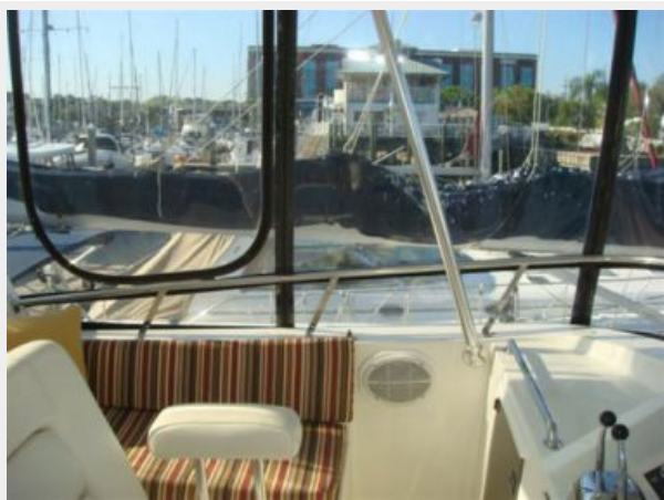
43' Tradewinds Flybridge Port