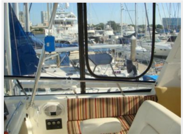
43' Tradewinds Flybridge Starboard