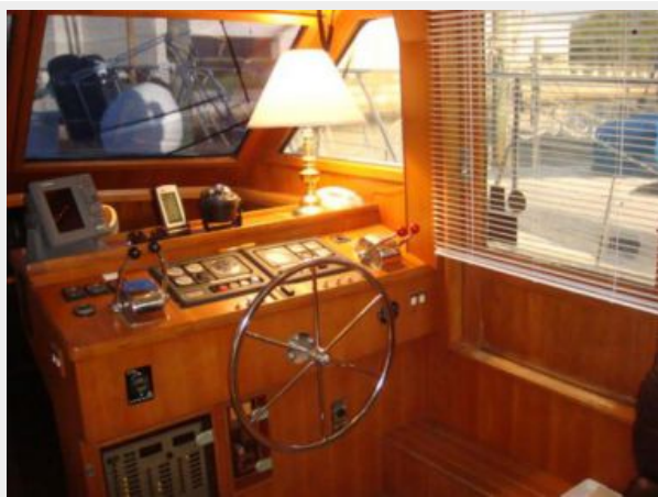
43' Tradewinds Lower Helm Photo1