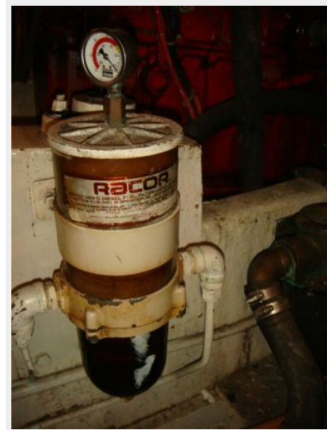
43' Tradewinds Starboard Racor Fuel Filter