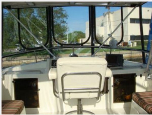
43' Tradewinds Flybridge Forward