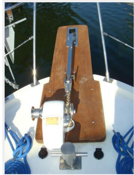
43' Tradewinds Anchor Windlass