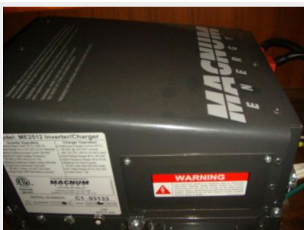
43' Tradewinds Inverter