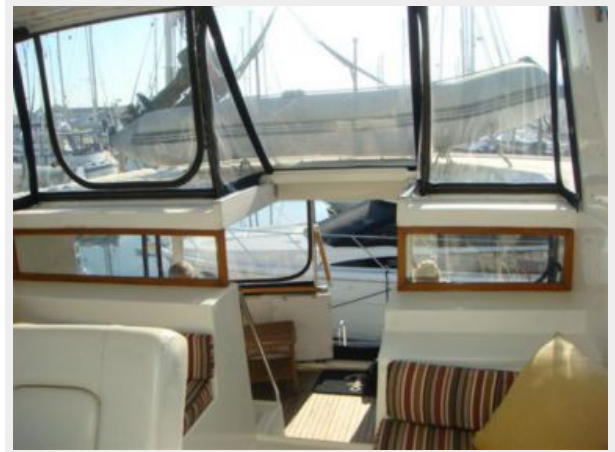
43' Tradewinds Flybridge Aft