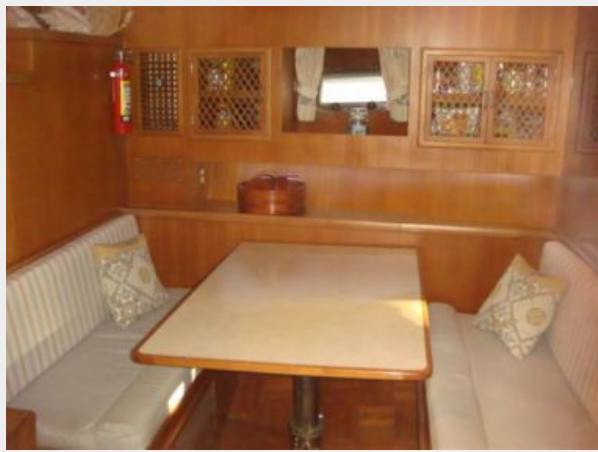
43' Tradewinds Dinette