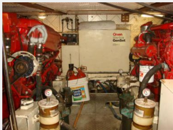
43' Tradewinds Engine Room Aft