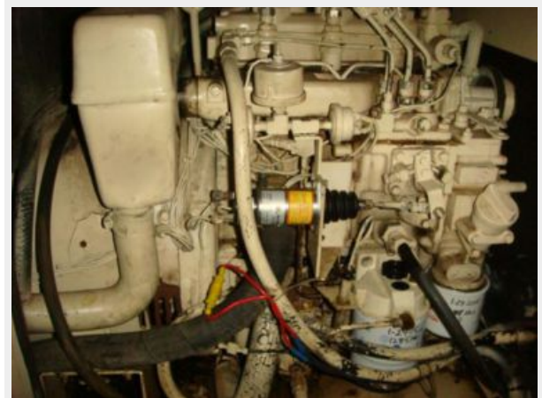
43' Tradewinds Generator