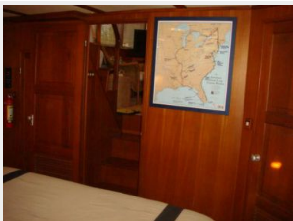
43' Tradewinds Master Stateroom Forward