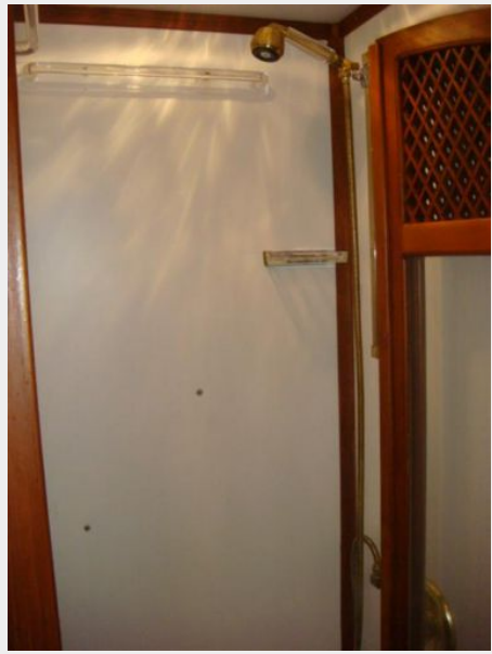
43' Tradewinds Master Stateroom Shower