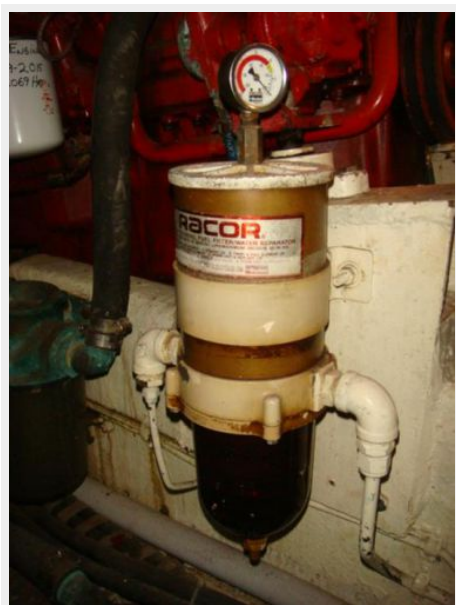
43' Tradewinds Port Racor Fuel Filter