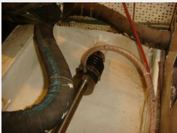
43' Tradewinds Starboard Shaft Seal