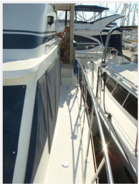
43' Tradewinds Port Side Deck Photo1