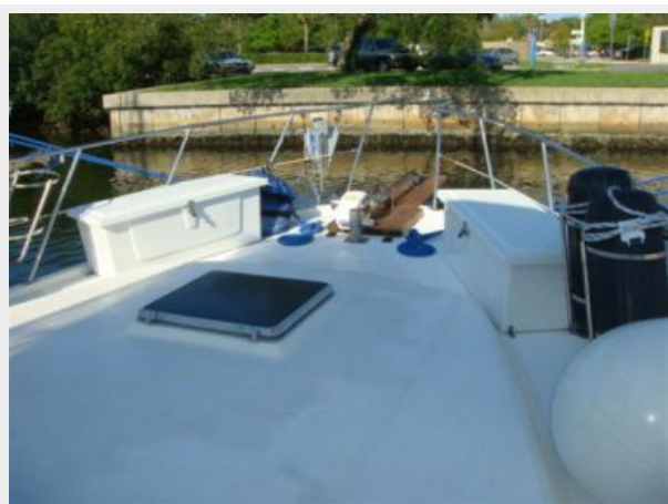
43' Tradewinds Foredeck