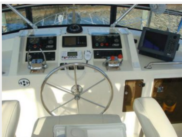
43' Tradewinds Flybridge Helm