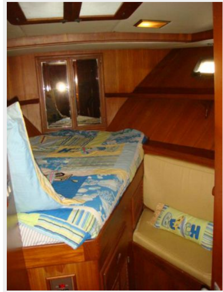
43' Tradewinds Guest Stateroom