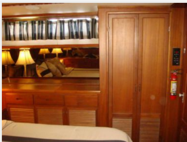
43' Tradewinds Master Stateroom Port