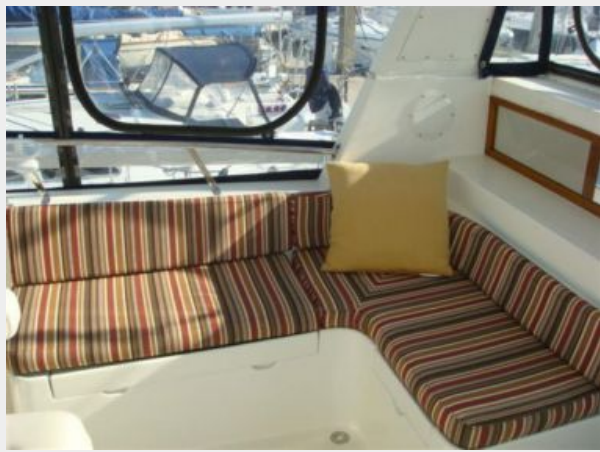
43' Tradewinds Flybridge Starboard Seating