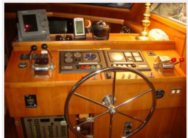
43' Tradewinds Lower Helm Photo2