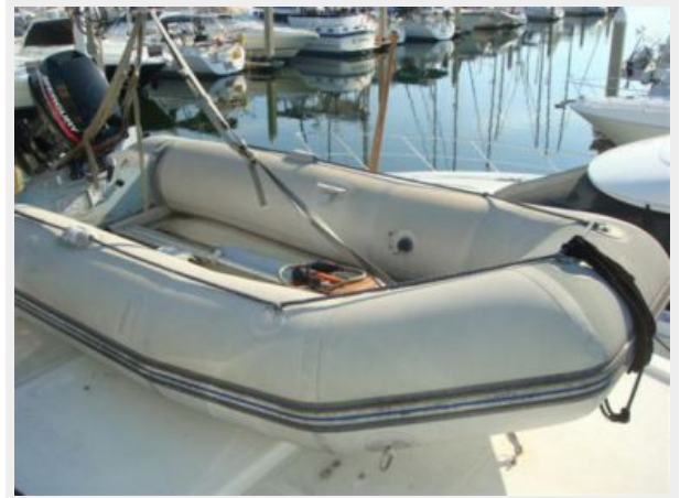
43' Tradewinds Tender