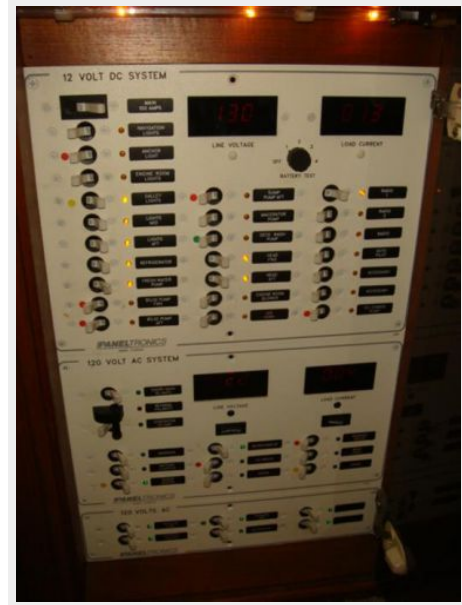
43' Tradewinds Electrical Panel