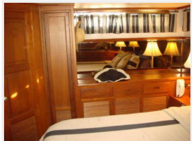
43' Tradewinds Master Stateroom Starboard