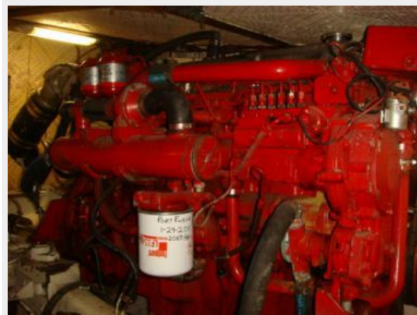
43' Tradewinds Port Main Engine