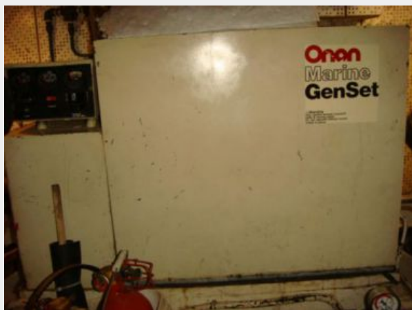
43' Tradewinds Generator Soundbox