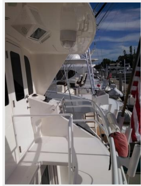
Aft Deck Aerial