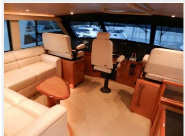
Flybridge - Helm