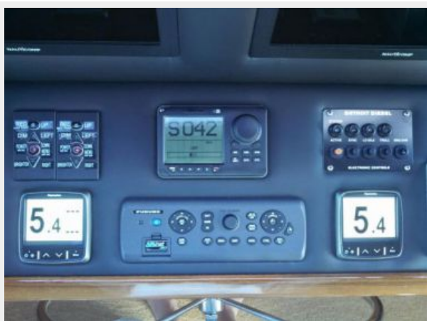
Helm - Centre