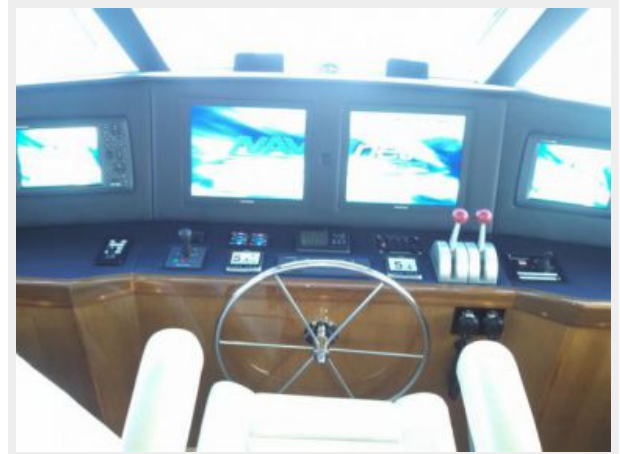
Helm - 4 screen Display