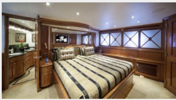
Second Master Stateroom