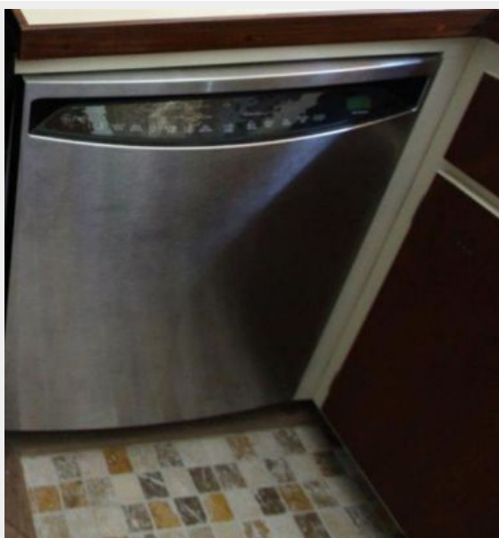
Galley - Dishwasher