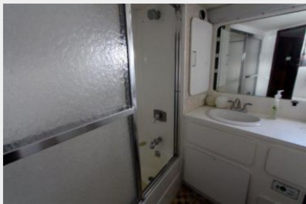
Master Stateroom EnSuite