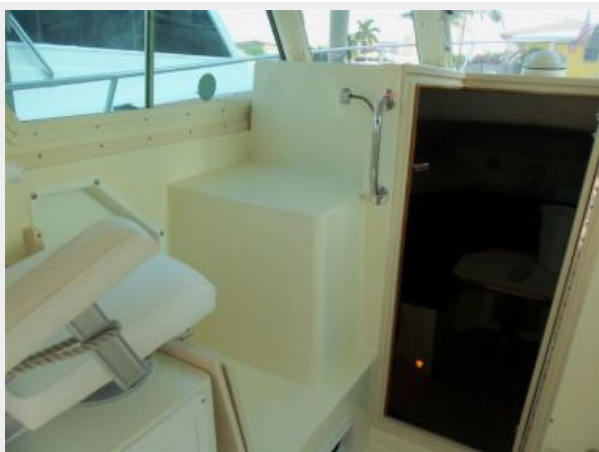
Helm Area to Port