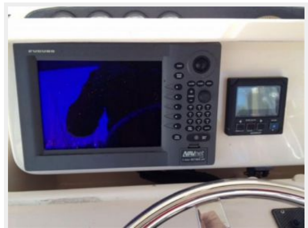
Furuno NavNet Display