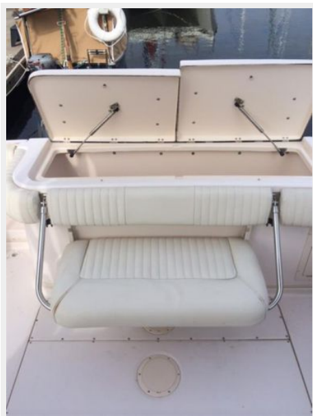
Aft Seat Down