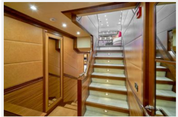
Stairs to staterooms