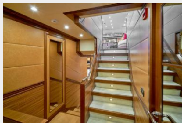
Stairs to staterooms