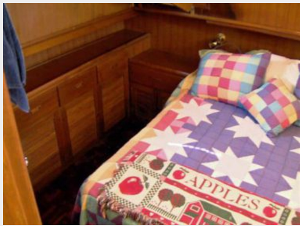
Master Stateroom Starboard