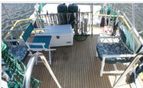
Mid Deck from bridge