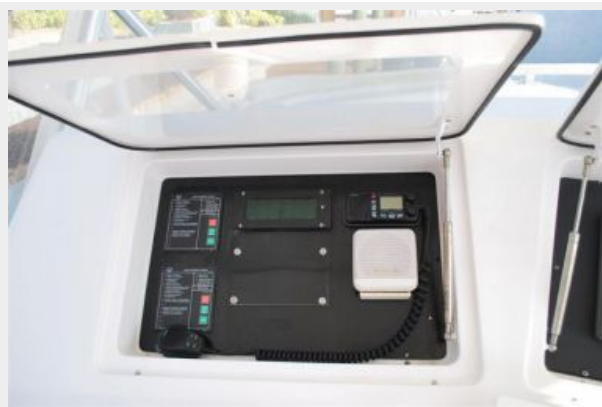
Fly Bridge Helm