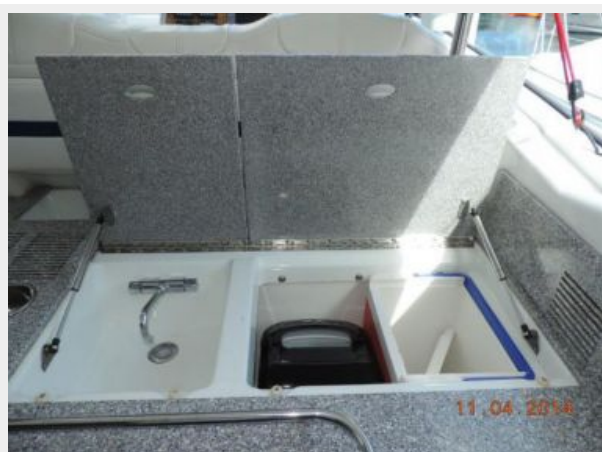
Beverage Center & Sink