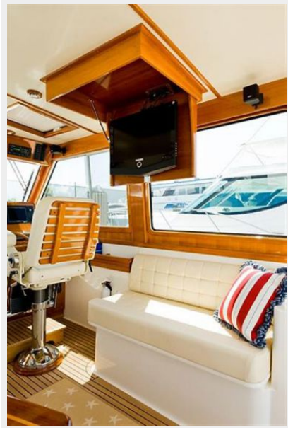
Helmdeck - TV drop down