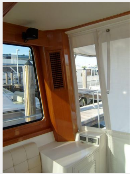
Helmdeck - custom A/C pillar