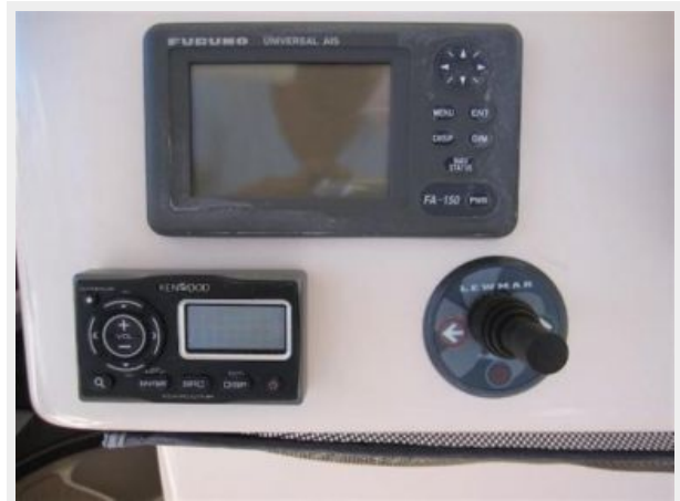
Bow Thruster, Remote Stereo Controller, Furuno Data Display