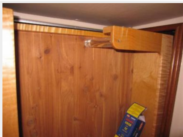
Aft Cabin Closet