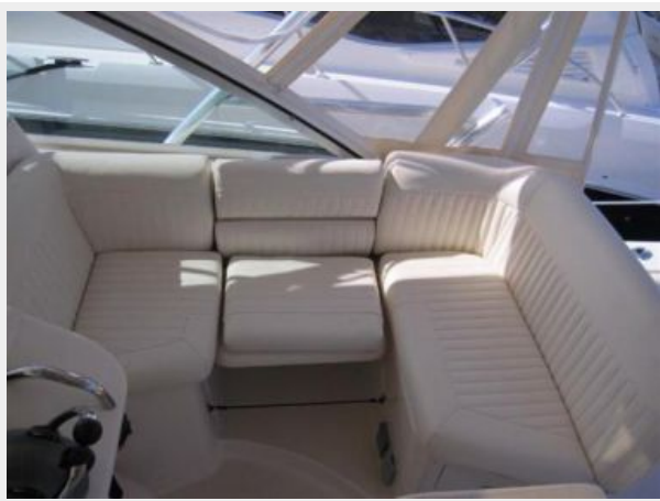
Helm Deck Seating