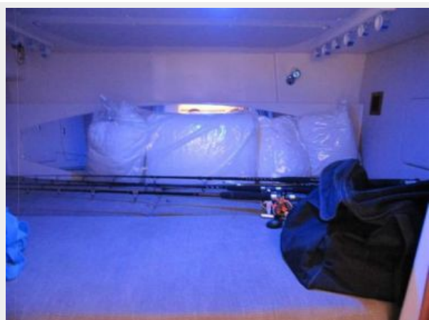
Aft Cabin Blue LED