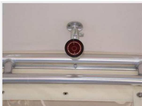
Cockpit Fish-On Camera