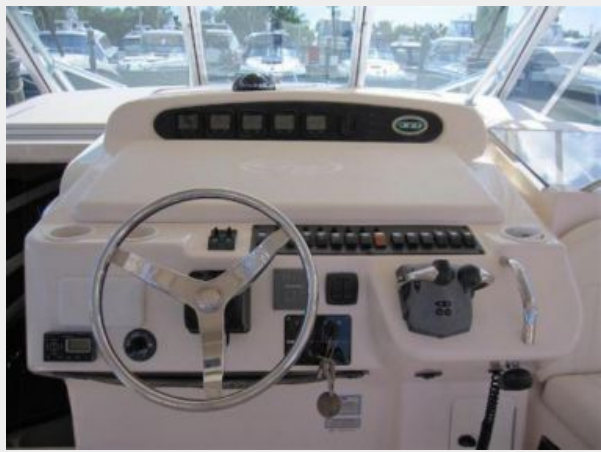
Helm Console Down