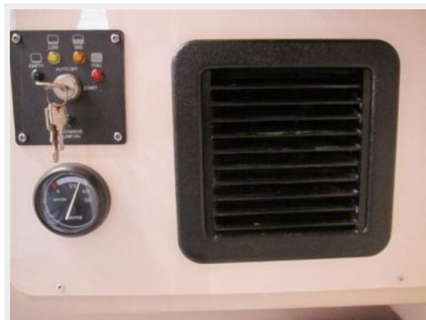
Shower Ventilation and Tank Control