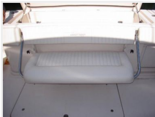
Cockpit Fold-Away Seat