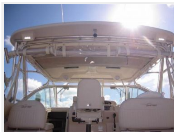
Cockpit LED's and Camera