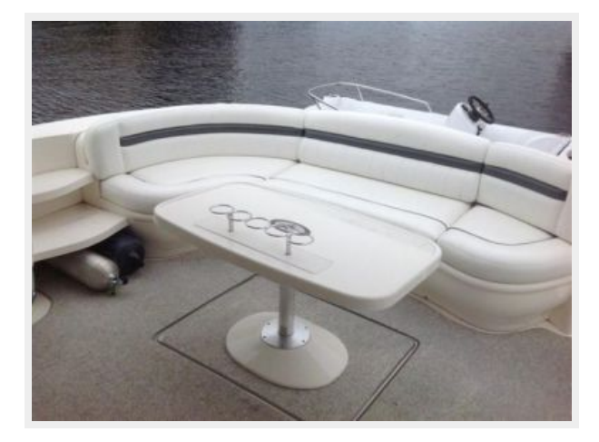
COCKPIT FIBERGLASS TABLE