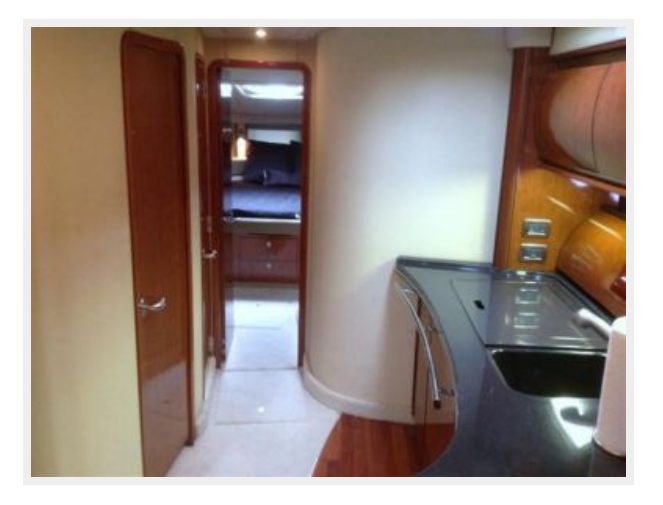
MASTER CABIN 1