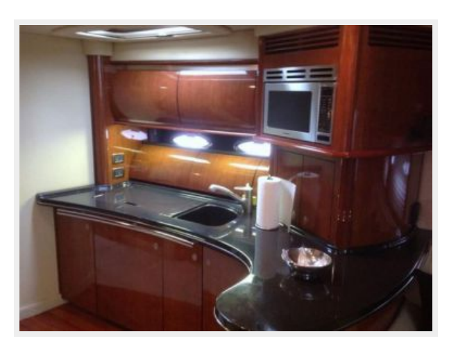
CARPET & CHERRYWOOD SOLE