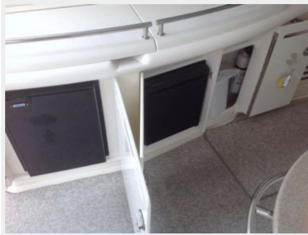
WET BAR W/ ICEMAKER & FRIDGE