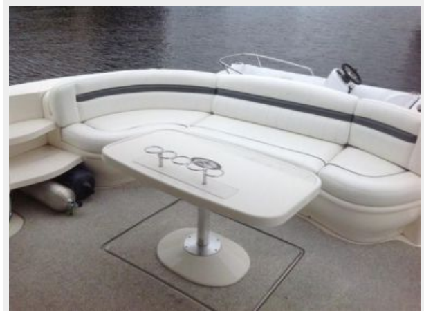
COCKPIT FIBERGLASS TABLE