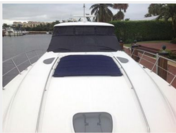
FOREDECK SHOWING GALLEY SKYLIGHT