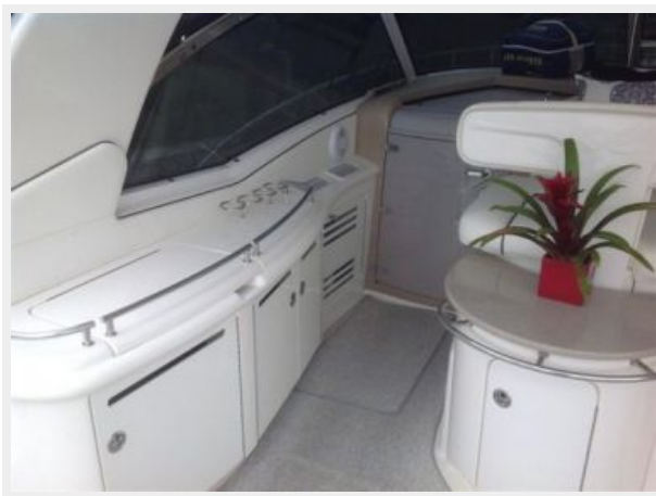
WET BAR & ENTRY TO INTERIOR