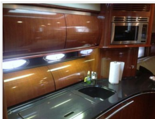
FIBERGLASS SINK AND COUNTER