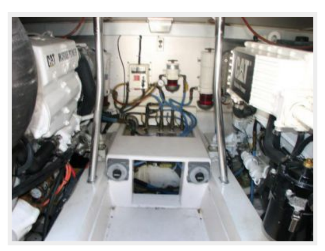
Engine & Mechanical Equipment 3 -Starboard Engine