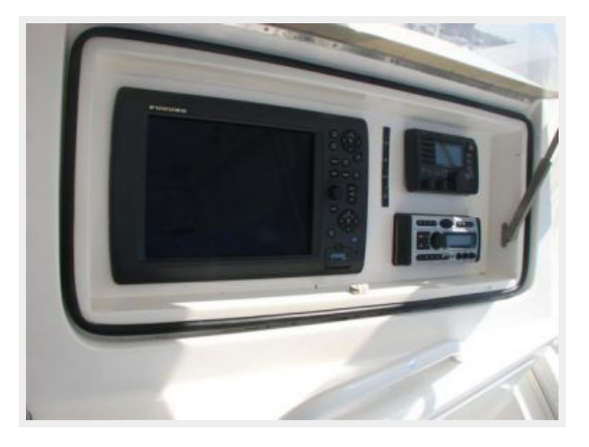
Deck 2 - Bridge Forward