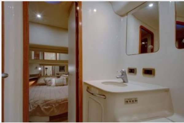
Port Stateroom (3)