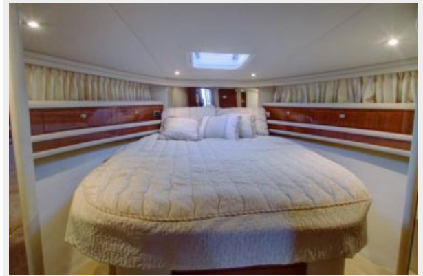
Master Stateroom (2)