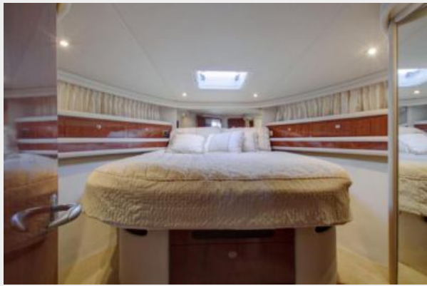
Master Stateroom (Bow)