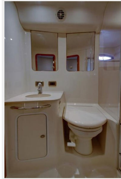
Guest/Day Head (2)