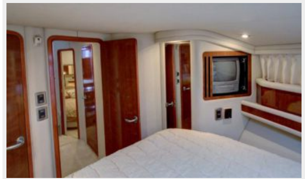
Master Stateroom To Port