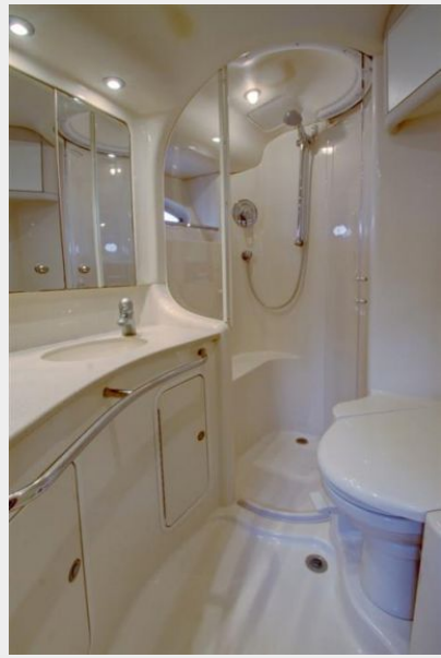
Master Head (2)