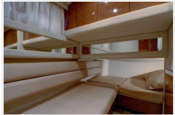
Starboard Stateroom Aft Bunk & Sofa That Converts To Twin Bunk