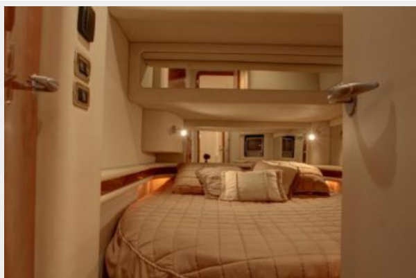
Port Stateroom (2)