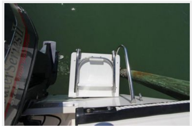
Swim Step W/Fold-Down Stainless Ladder