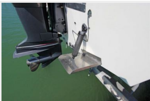
Hydraulic Trim Tabs