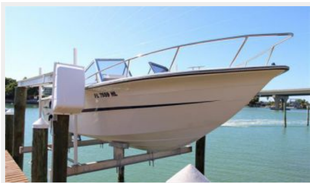
Bow W/Stainless Railing