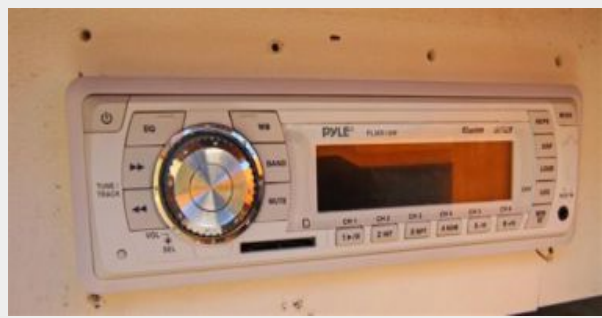
Pyle CD/Radio Pyle CD/Radio