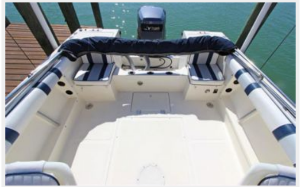
Large Cockpit W/Transom Seating & Coaming Pads