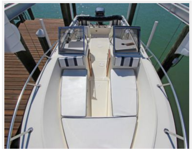
Bow Looking Aft