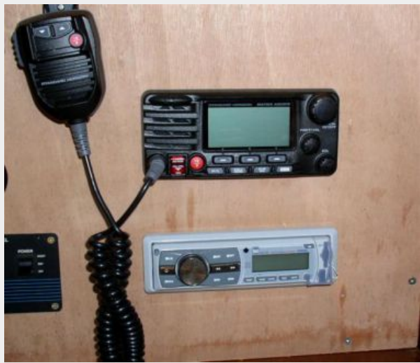
Nav station, 3