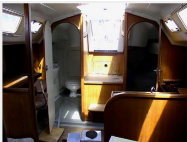
Salon looking fwd.