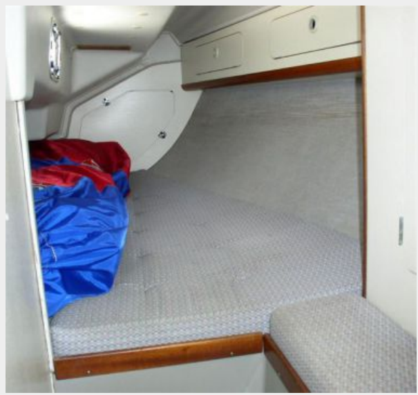
Aft berth. 2