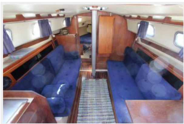
Main Salon with Settees to Port & Starboard