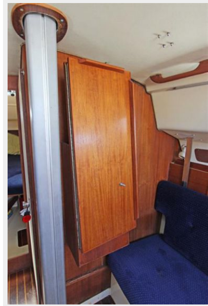
Dinette Table folds away onto bulkhead