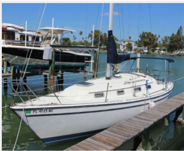
Portside Bow View