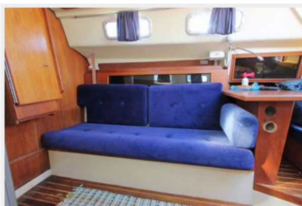
Starboardside Settee forward of Navigation Station