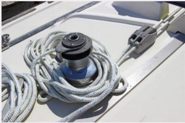
Lewmar 30 Self-Tailing Winch Port