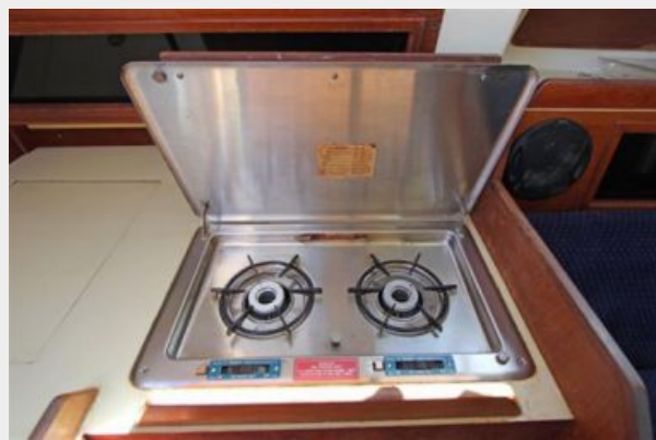
2-Burner Propane Stove Top