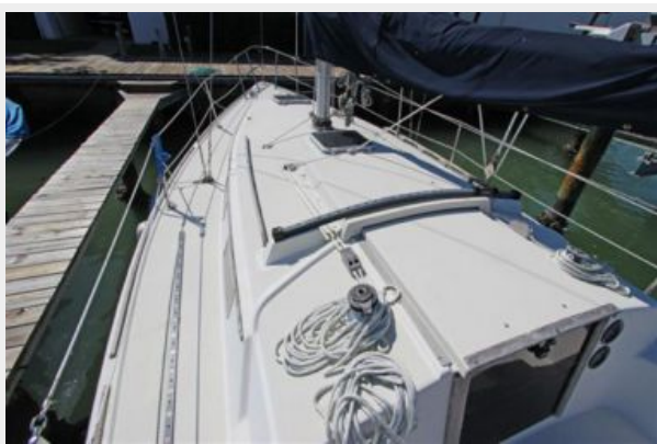
Bow Forward from Cockpit-Great Visability!