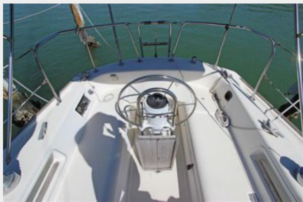
Large Cockpit looking aft