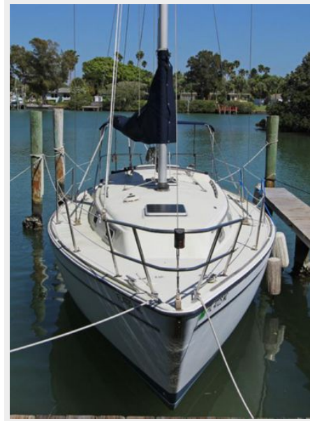
Bow View looking Aft