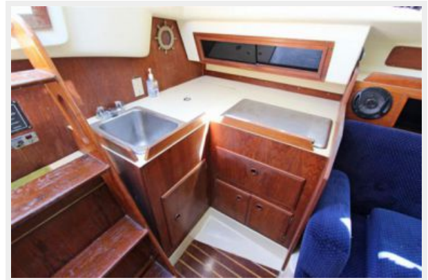
L-shaped Galley to Port