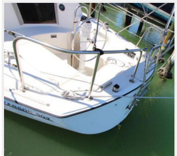
Stern View with fold-up Ladder