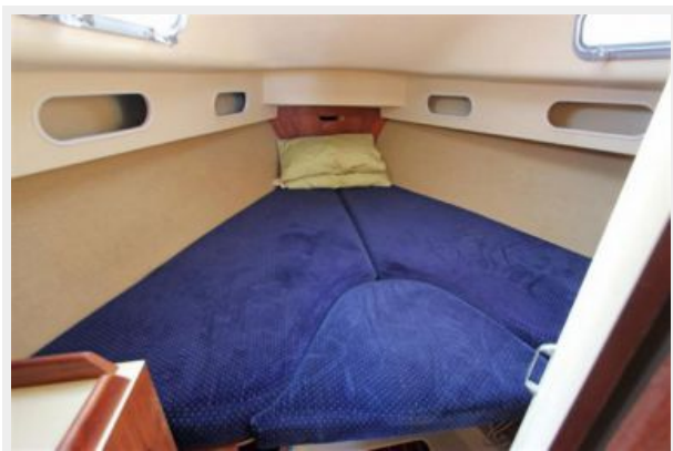
Forward V-Berth Stateroom