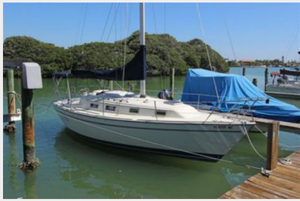
Wide sidedecks for easy access to bow