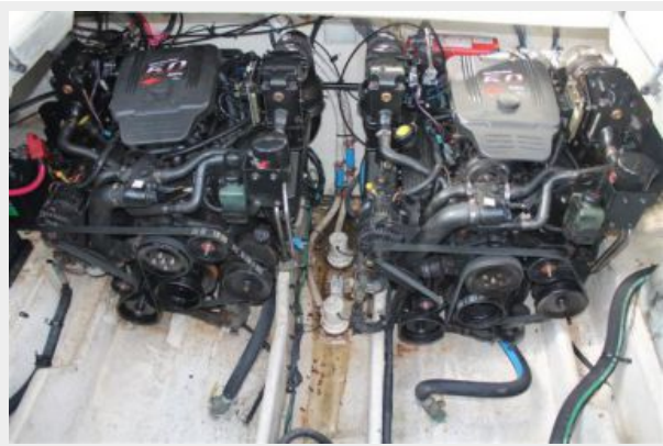
Twin Merc 5.0 260HP