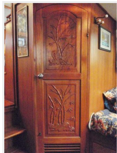
Head Door Detail