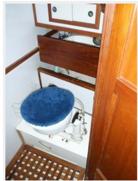
Guest Head I