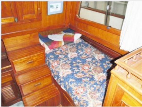
Master Stateroom Port