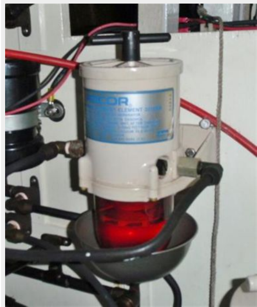
Coast Guard Approved Racor Fuel Filter