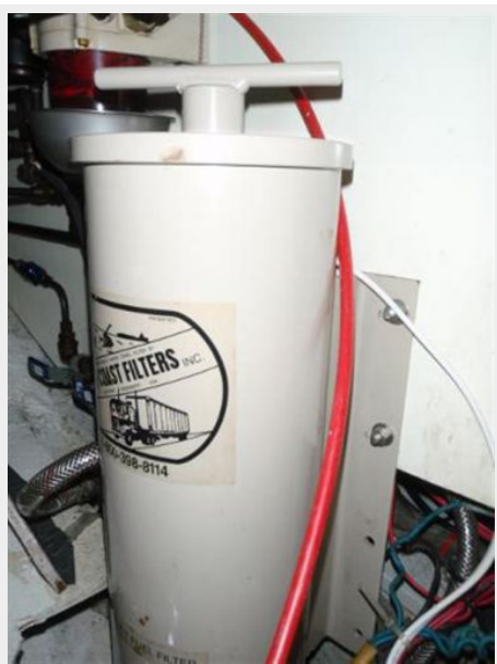
Gulf Coast Oil Filter