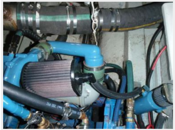
Walker Airsep System