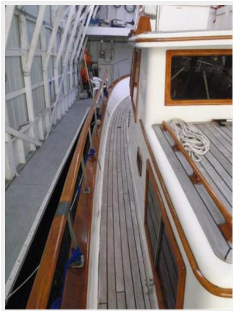
Port Side Deck