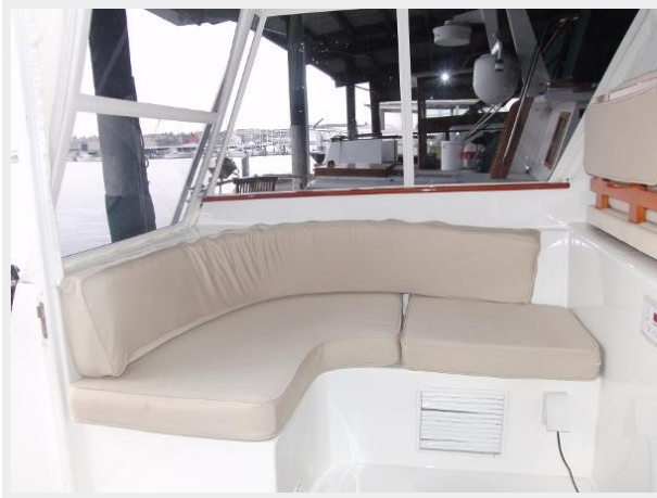
Mid cabin seating port