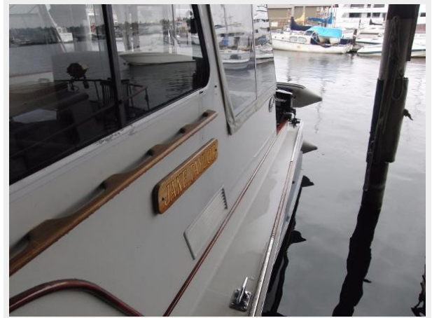
Port side facing aft