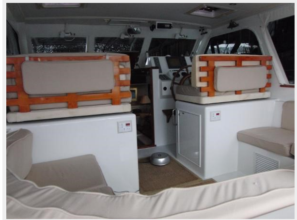
Mid cabin from cockpit