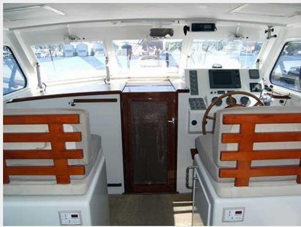
Looking forward in midcabin