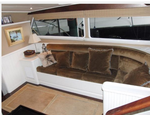
Salon to starboard