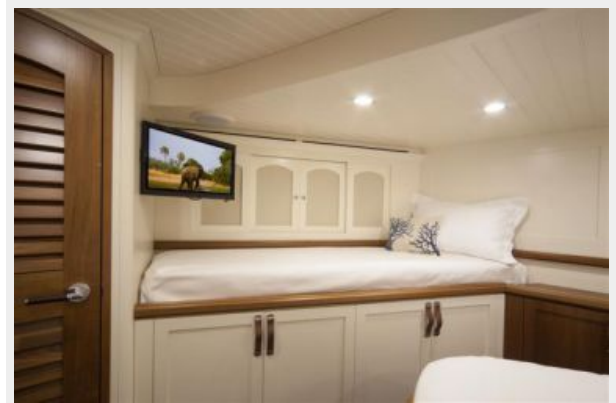
Forward V-Berth Stateroom