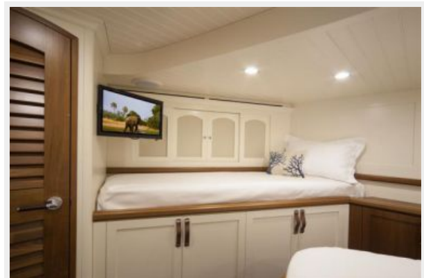
Forward V-Berth Stateroom