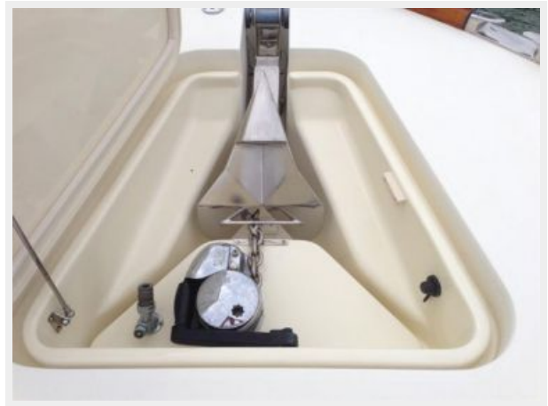
Fold Away anchor w/Windlass and Washdown