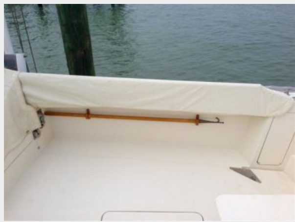
Coaming Board Covers