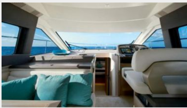
View from Salon looking forward