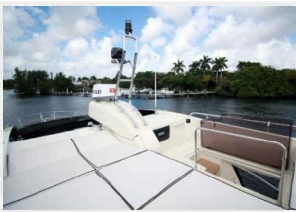
Sunlounge on Hard Top