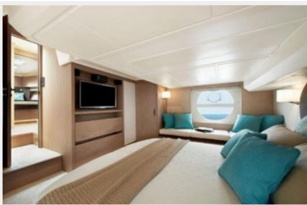
View from port looking to starboard in Master