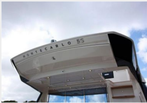
Electric Awning opening