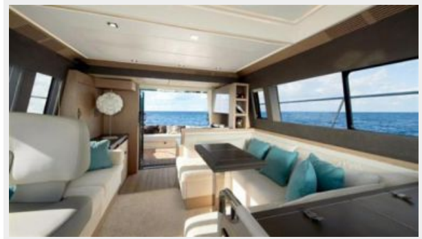
View from helm looking aft