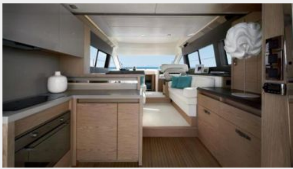
View from galley looking forward