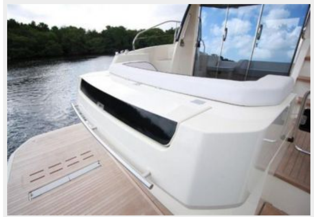
Hydraulic Swim Platform