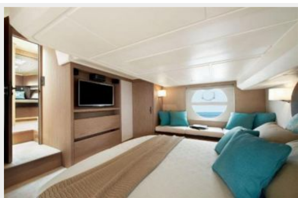
View from port looking to starboard in Master