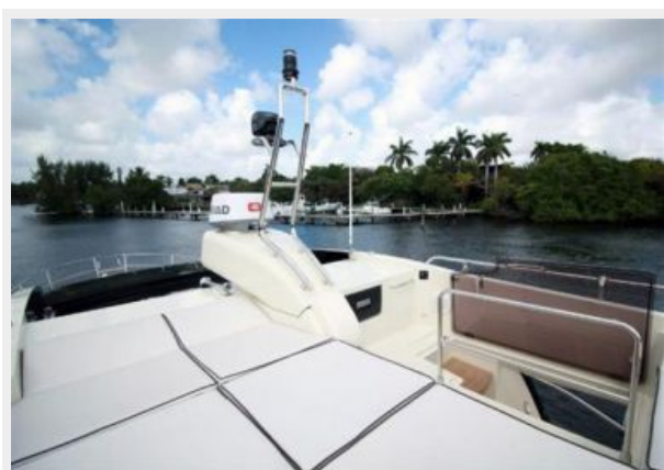
Sunlounge on Hard Top