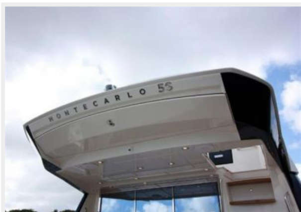
Electric Awning opening