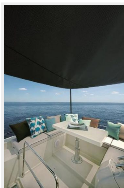
Sunlounge with Canopy and table up