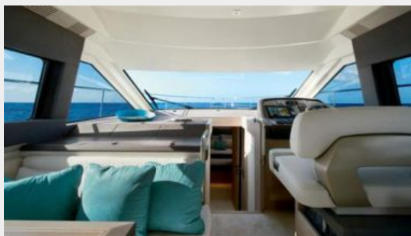
View from Salon looking forward