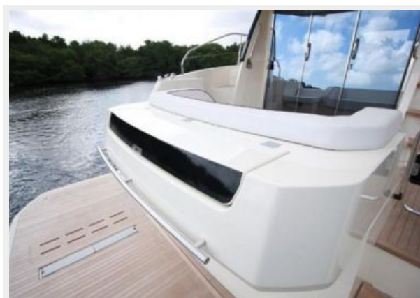
Hydraulic Swim Platform