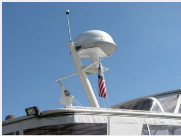
Helm / Electronics & Navigation 3 - SAT TV