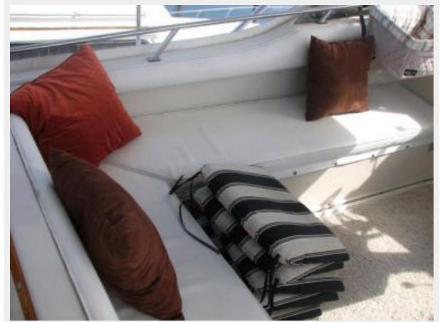
Deck 1 - Upper Helm Seating