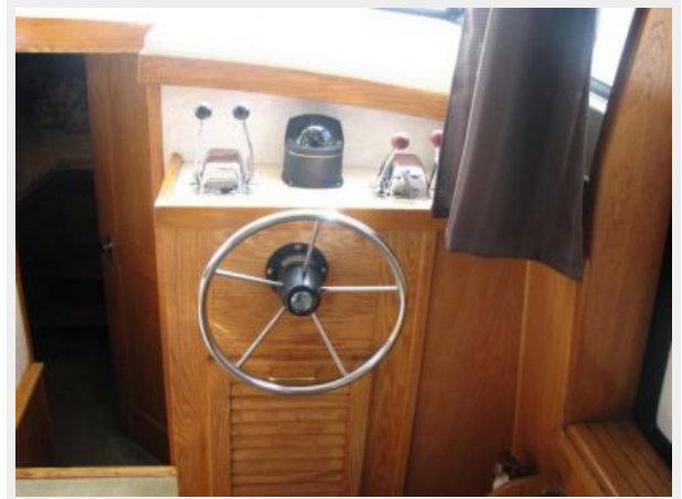
Helm / Electronics & Navigation 2 - Lower Helm