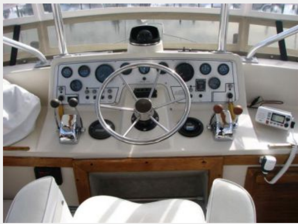
Helm / Electronics & Navigation 1 - Upper Helm