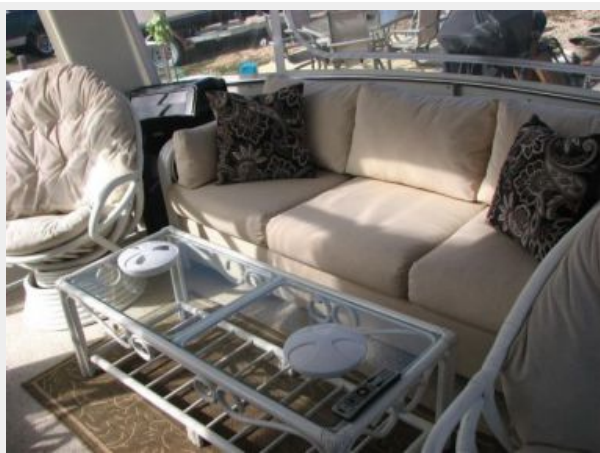
Deck 2 - Aft Deck