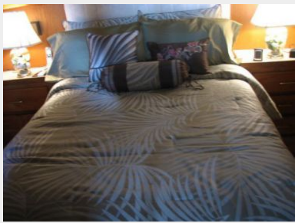
Master Stateroom, Aft