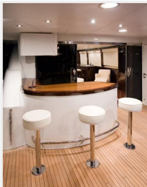
Aft Deck Bar