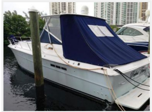
Full aft enclosed cockpit with windows