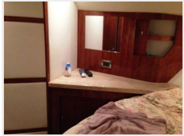
Master to Starboard counter and storage