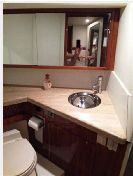
Head sink and electric toilet