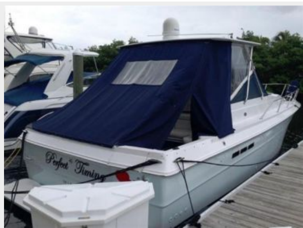
Full cockpit protection