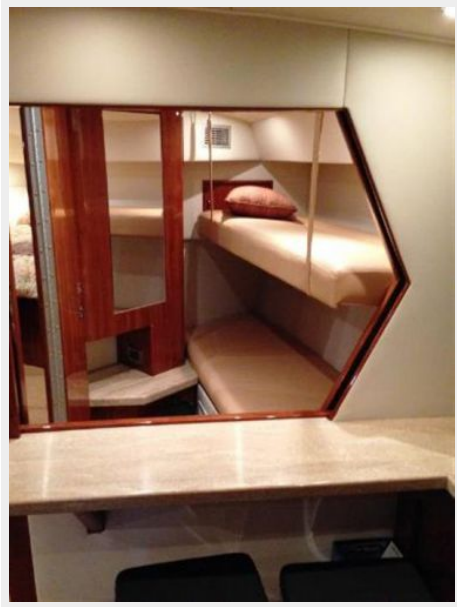
Guest cabin with closing bulkhead open to salon