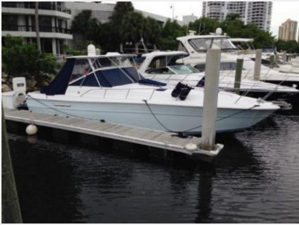
Starboard profile - Custom hard top and enclosure