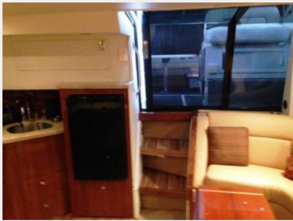
Salon looking aft to cockpit entrance