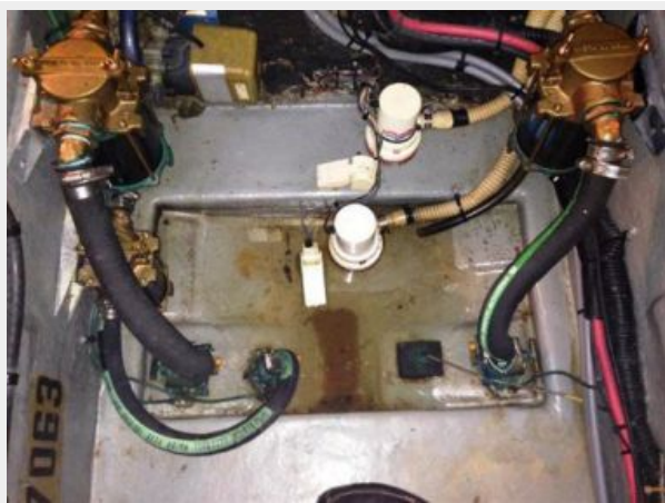
Bottom of Engine room (Sea Chest)