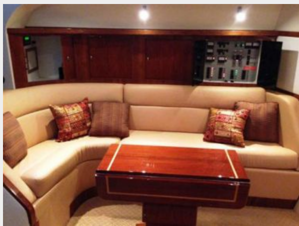
Main Salon L-shaped settee to Port