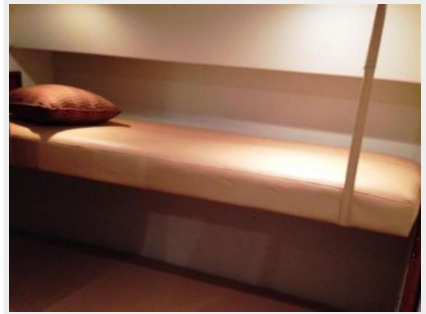
Guest cabin with upper bunk that can be lowered to form back for settee