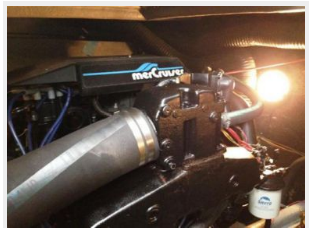
Well maintained Engine room - 2