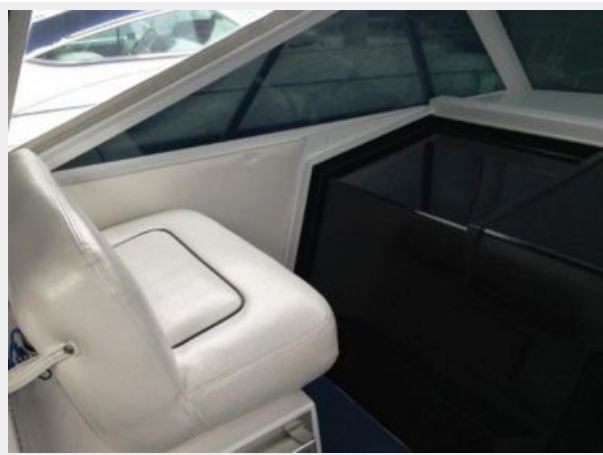
Port Guest seating accross from Helm