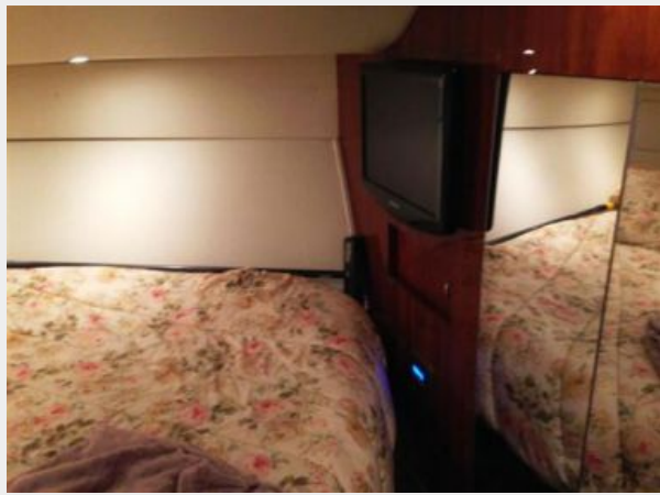
Master to Starboard with TV and mirrored closet