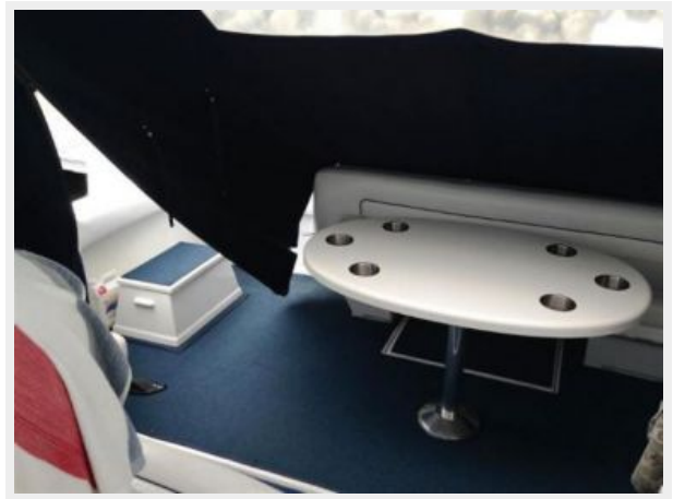
Lower cockpit seating and table