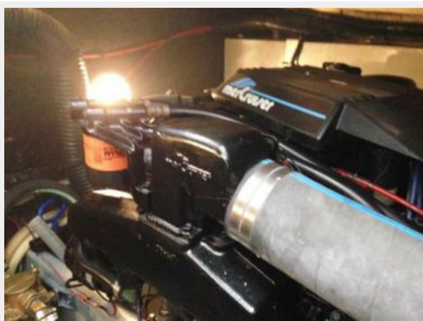
Clean Engine room - 1