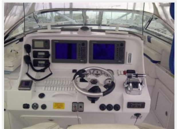
Helm Console - center