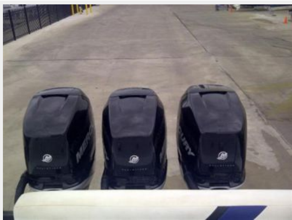
Triple Mercury Verados