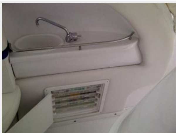
Wet Bar - Stbd, Forward of Helm