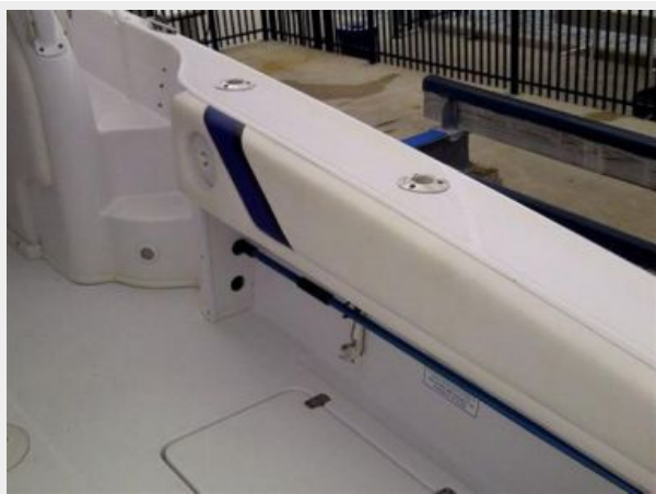
Stbd side Walk-around