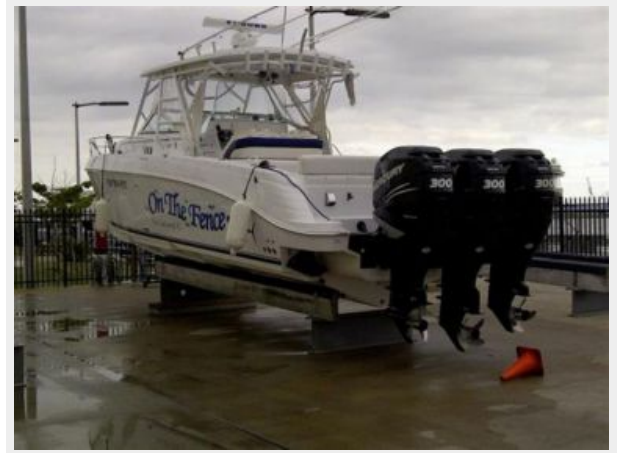
Port Side Profile