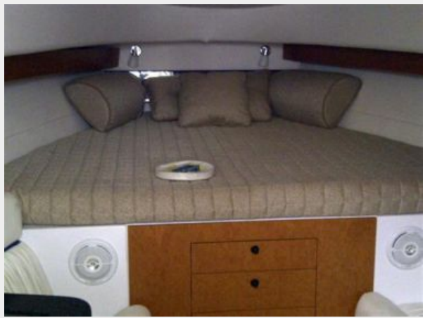
Cabin View Forward