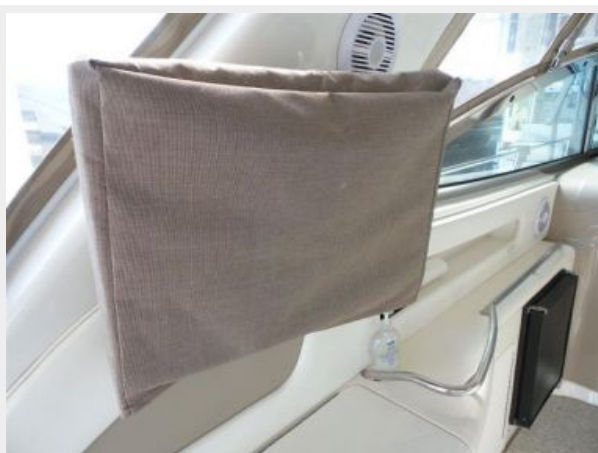
Main Deck TV