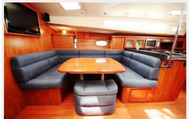
Hunter 50 AC Dining Table