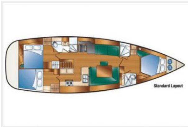
Hunter 50 AC Layout