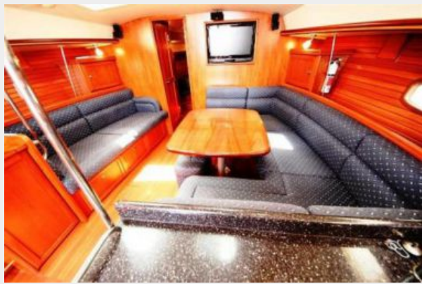
Hunter 50 AC Main Salon