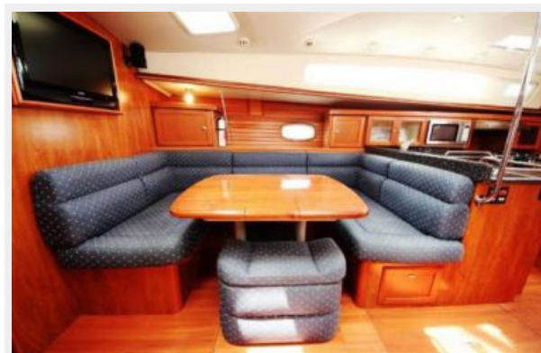
Hunter 50 AC Dining Table