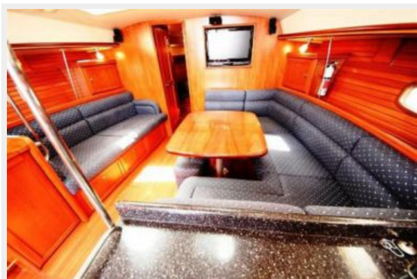
Hunter 50 AC Main Salon