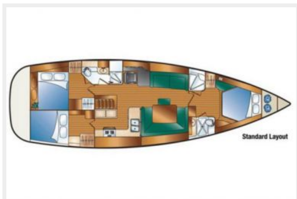
Hunter 50 AC Layout