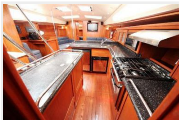
Hunter 50 AC Galley