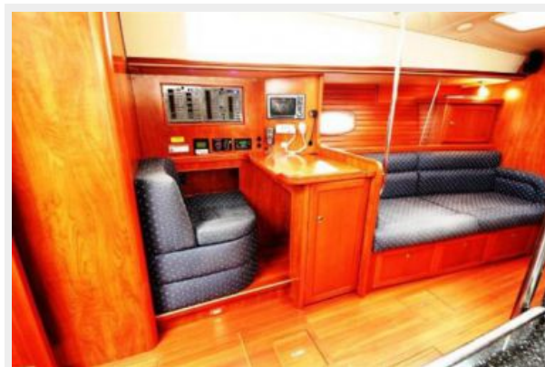
Hunter 50 AC Port Main Salon