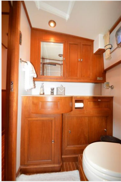
'07 Eastbay 47 FB, Guest Head Cabinetry