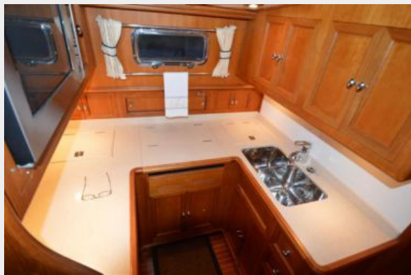
'07 Eastbay 47 FB, Galley