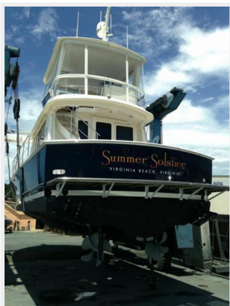
'07 Eastbay 47 FB, Stern View