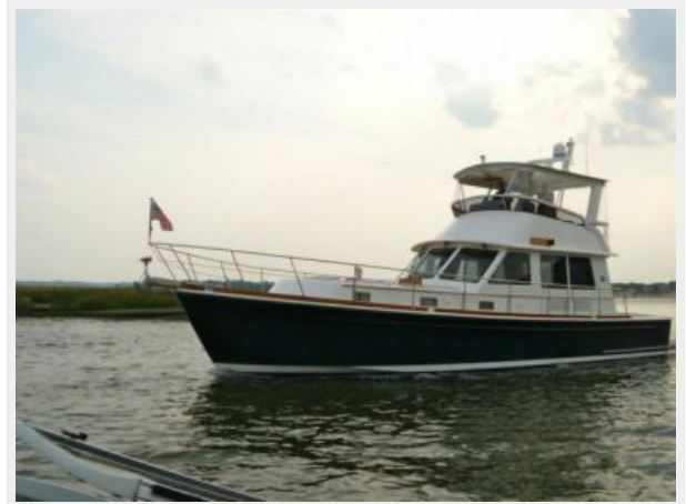
'07 Eastbay 47 FB, Port Bow