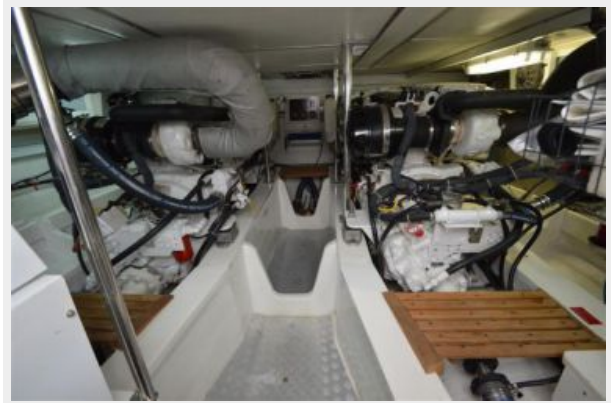
'07 Eastbay 47 FB, Engine Room