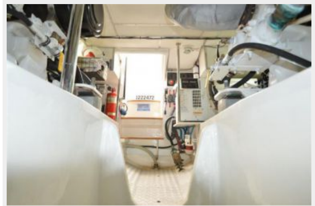
'07 Eastbay 47 FB, Looking Aft in Engine Room