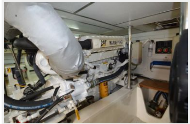
'07 Eastbay 47 FB, Cat C-12 Port Engine