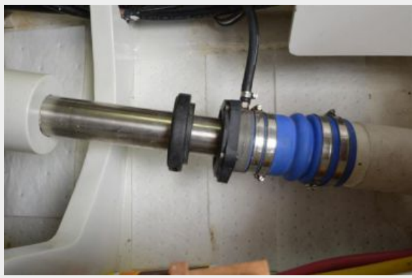
'07 Eastbay 47 FB, Dripless Shaft Seals w/ Spare Seal