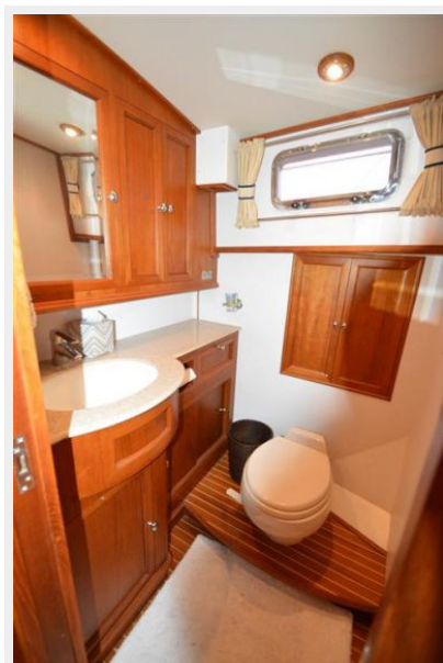
'07 Eastbay 47 FB, Guest Head & Shower