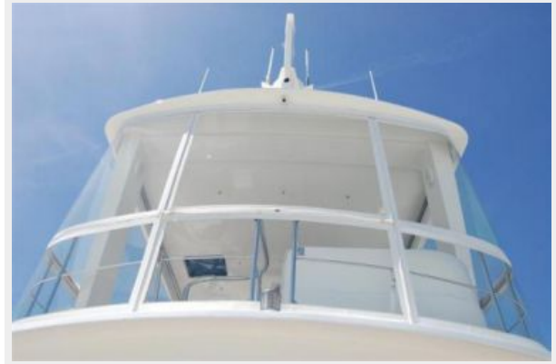
'07 Eastbay 47 FB, NOTE cockpit camera on back of mast