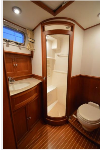
'07 Eastbay 47 FB, Master Head & Shower