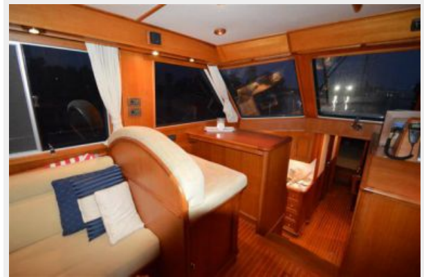
'07 Eastbay 47 FB, Passenger Seating