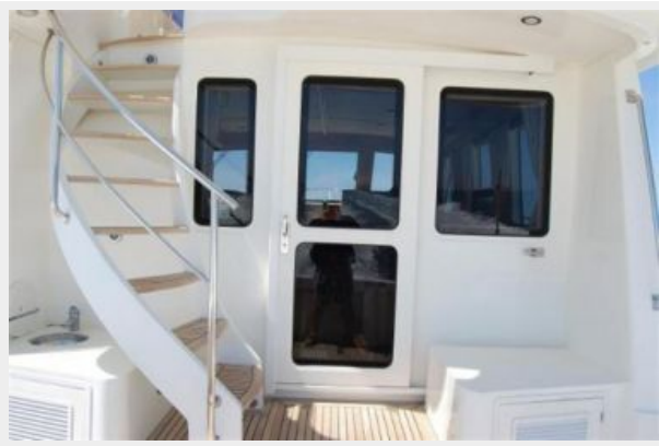
'07 Eastbay 47 FB, flybridge stairs