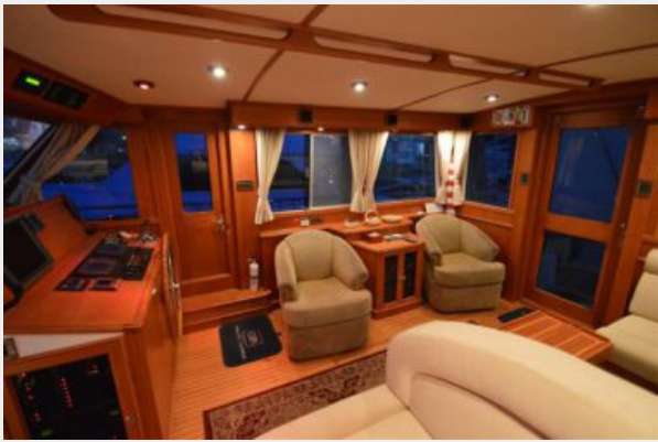
'07 Eastbay 47 FB, Stbd Side of Salon