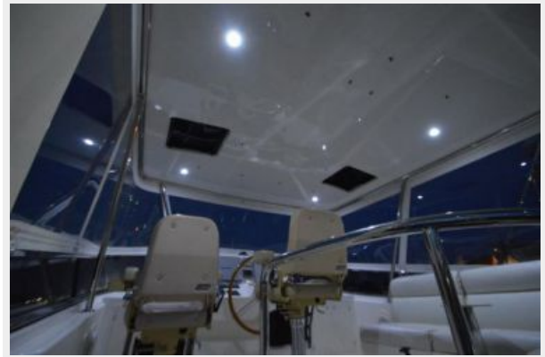
'07 Eastbay 47 FB, Flybridge