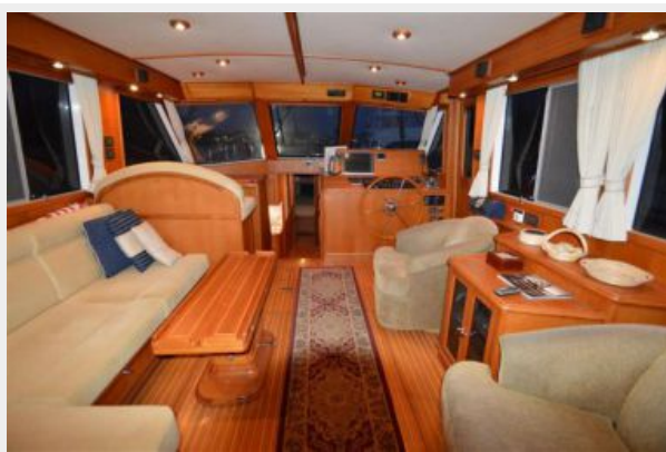
'07 Eastbay 47 FB, Looking Forward in the Salon