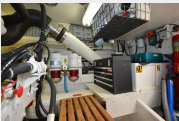
'07 Eastbay 47 FB, Duplex Racors, Toolbox