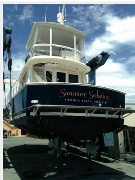
'07 Eastbay 47 FB, Stern View