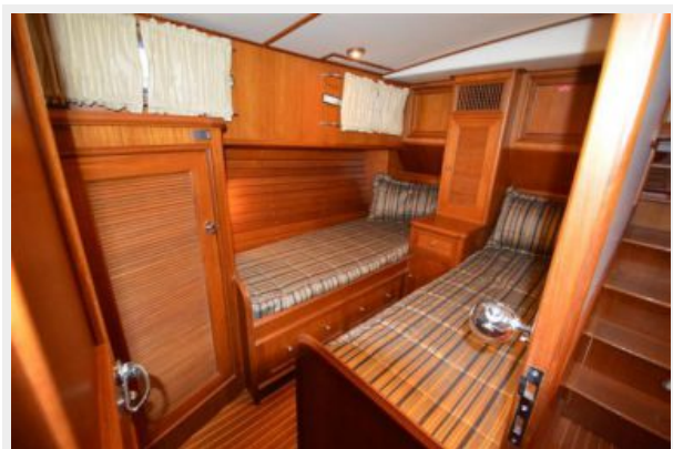
'07 Eastbay 47 FB, Guest Stateroom