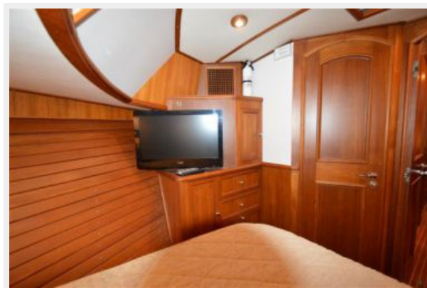
'07 Eastbay 47 FB, Master Stateroom TV