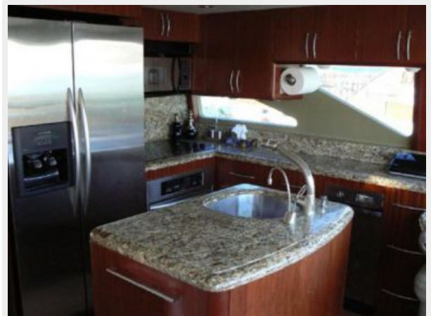
Full size galley