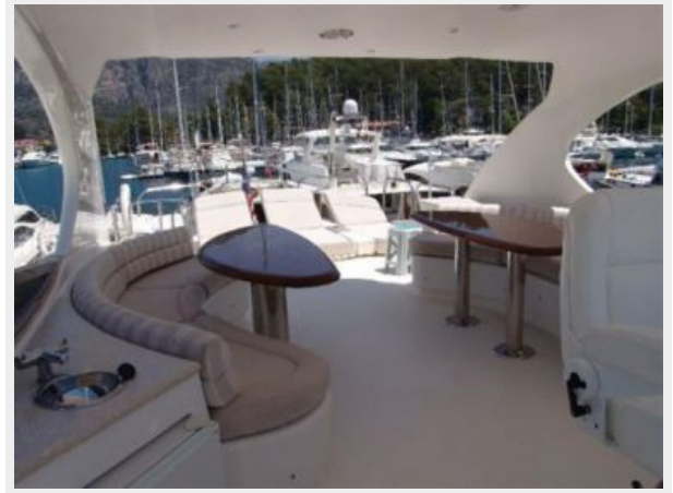
Flybridge aft before teak decking