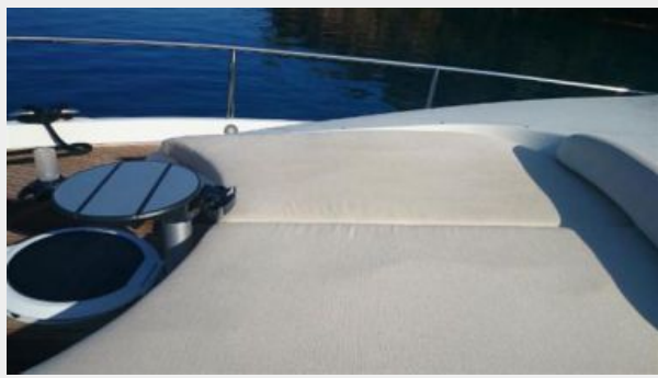
New foredeck sun lounge w/custom table