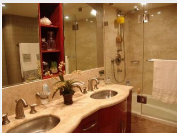
Master head vanity