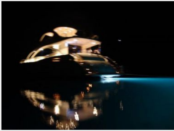
Night time glow