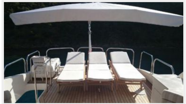
New bridge deck sun lounge