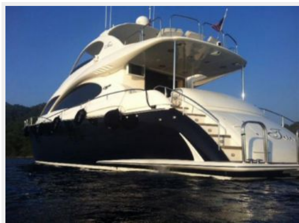
Port aft with new hull paint