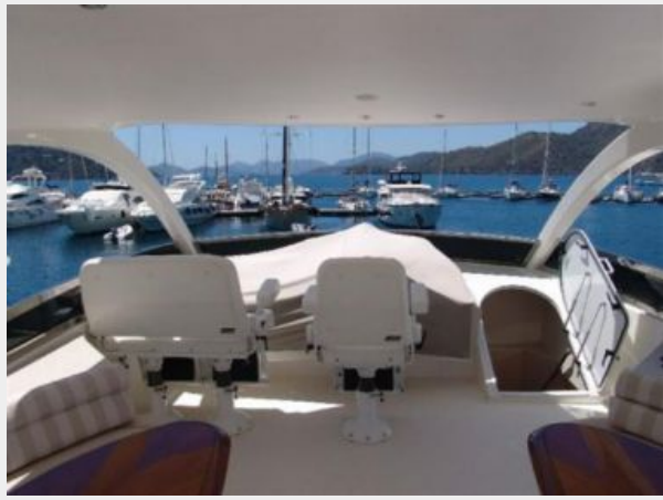
Flybridge forward before teak decking