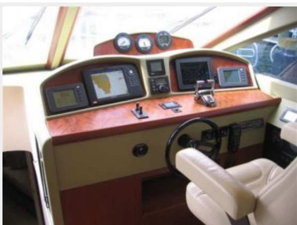
Lower helm station