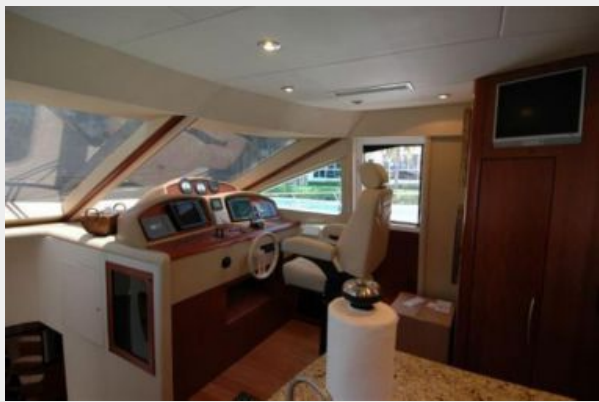
Lower helm station